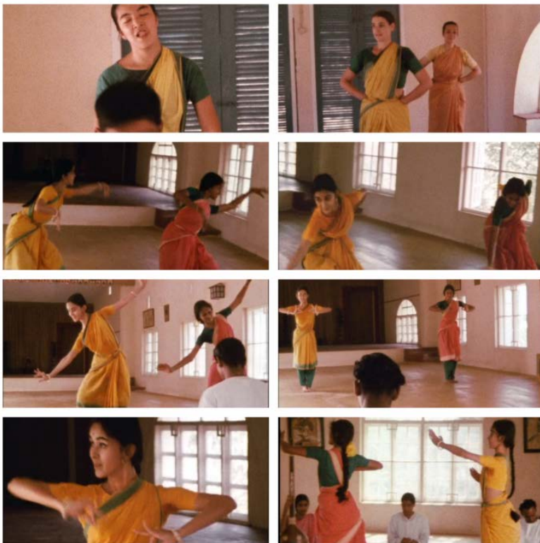
Fig. 2: Stills from Malle's Phantom India .

dance. There are several female pupils residing at the local school, but the camera first focuses on two foreign girls – one Japanese, the other American – who are trying to learn the dance moves, with considerable effort and never synchronised. The director’s gaze is then caught by two dancers in an adjacent room, both of whom are Indian, although they come from different regions. These two girls display a remarkable harmony and precision in executing the dance steps, moves, and postures. In the interview that follows, they show great composure. For Malle, just as for Harriet, this break with the contradictions of reality is an engrossing epiphany.