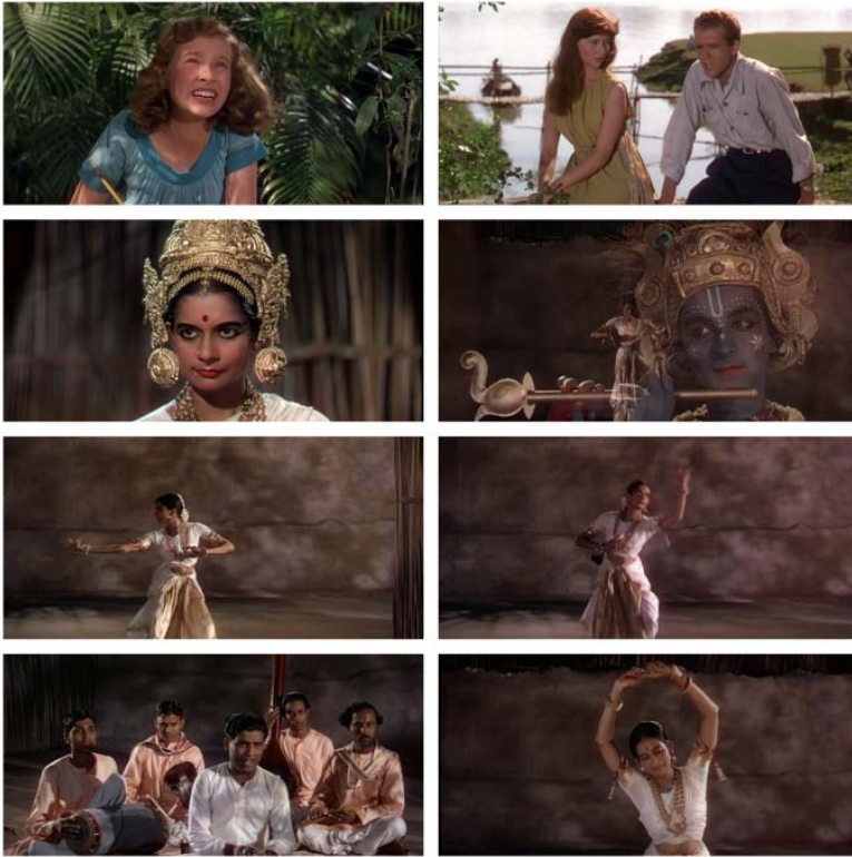
Fig. 1: Stills from Renoir's The River .

I recognise the same movements in Louis Malle's L'Inde Fantôme , a documentary film produced almost twenty years later. As is widely known, in 1968, just before the May events in France, Malle spent a few months in India together with a crew consisting of only a sound technician and a cameraman. Like many other Europeans – including many directors – Malle believed that the land of Gandhi and Nehru could regenerate his outlook on the world. However, the reality he encountered on his journey from the north to the south of the country failed to meet his initial expectations. In the seven episodes of what was to become a television series, he struggles to come to terms with poverty, conflicts, and social and ethnic contradictions. Mysticism, contemplation, harmony, and concord hardly play any part in the documentary, although they do in a sequence featured in the second episode, Choses vues à Madras . At Adyar the French director visits the headquarters of the Theosophical Society, where they teach Bharatanatyam, a 'traditional' Indian