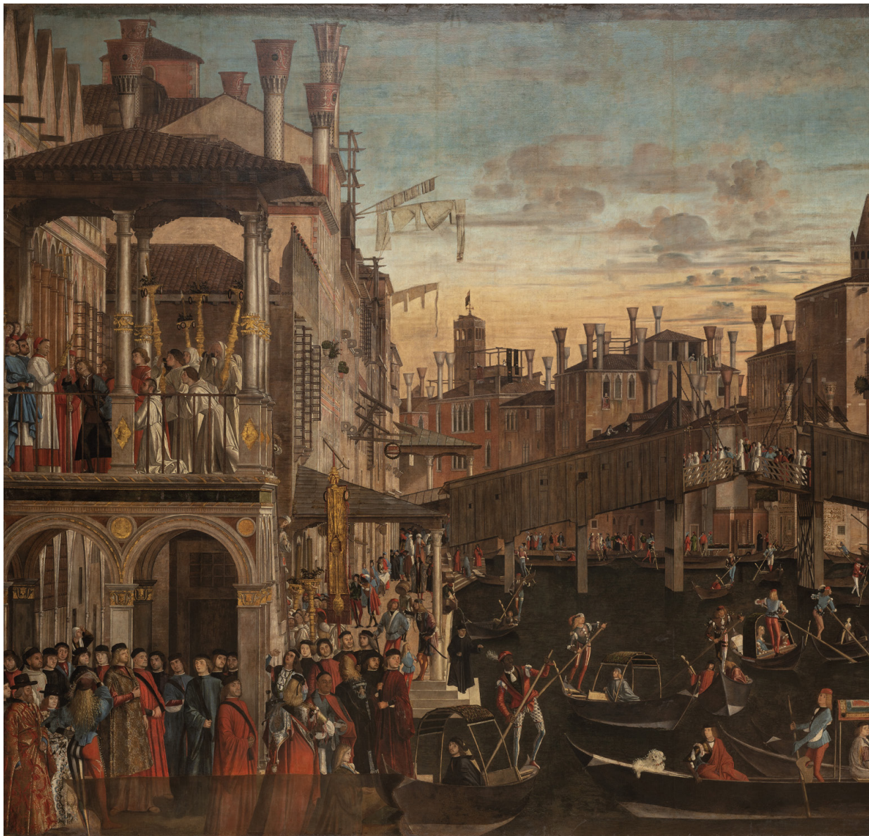
Figure 2 Vittore Carpaccio, Miracolo della Reliquia della croce , Venezia, Gallerie dell'Accademia.