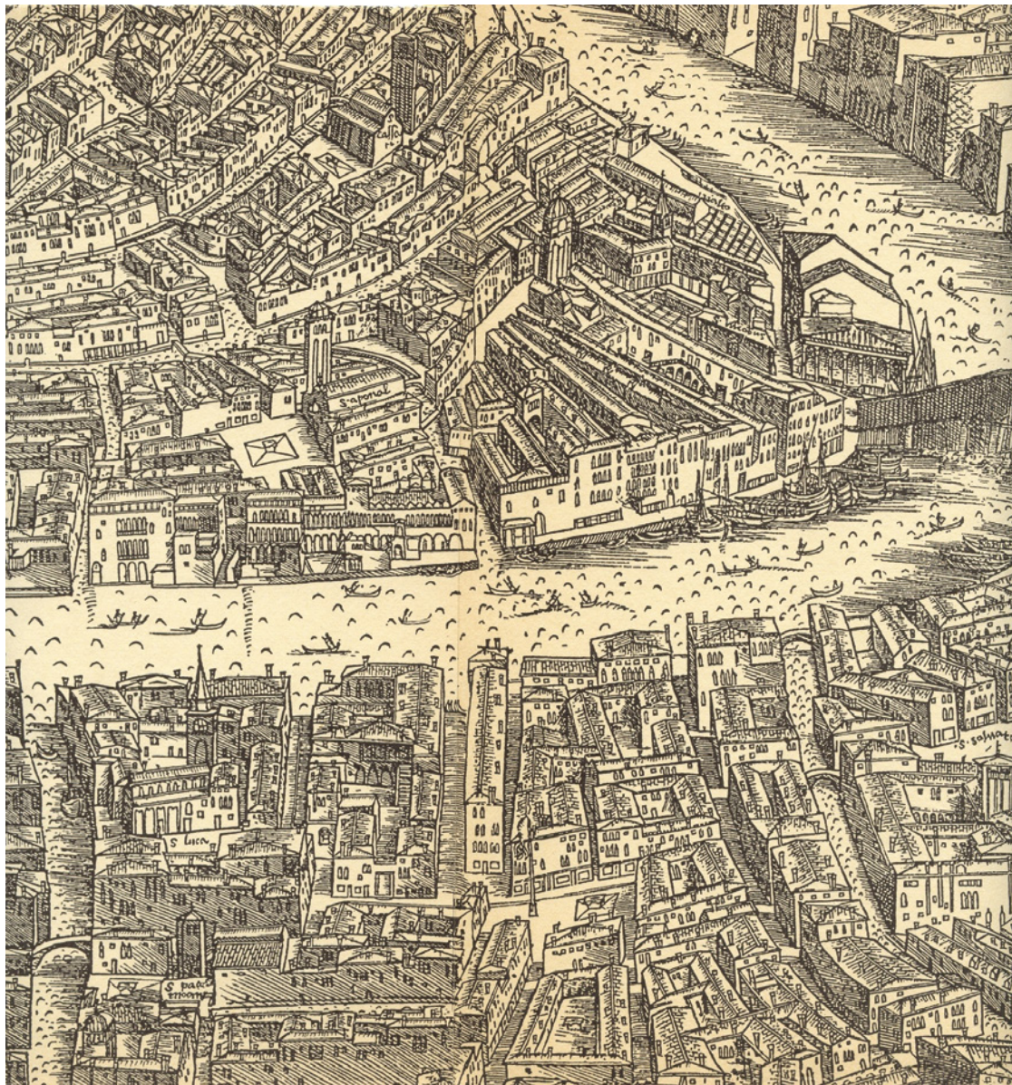
Figure 1 Jacopo de' Barbari, View of Venice . 1500. Xylograph. Detail