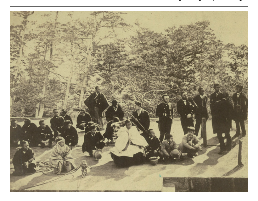
Figure 1 Baron Raimund von Stillfried, His Imperiall Majesty the Tenno of Japan and Suite. 1 January 1872. https://upload.wikimedia.org/wikipedia/commons/6/63/Emperor_Meiji_Inaugurating_ Yokosuka_Arsenal_Jan_1_1872.png

and their negatives were confiscated. The incident, however, had far-reaching implications for the government's policy of representing the emperor. As Luke Gartlan (2016, 73-100) has shown, there is a direct causal link between the illegal photograph and the subsequent total control that was enforced over the possession, display, and distribution of photographs of the emperor, as well as the official commissioning of imperial portraits by Japanese photographer Uchida Kuichi 內田九一 (1844-75).