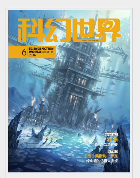
Cover of an issue of Science Fiction World.

MCLC Resource Center Publication (Copyright August 2020)