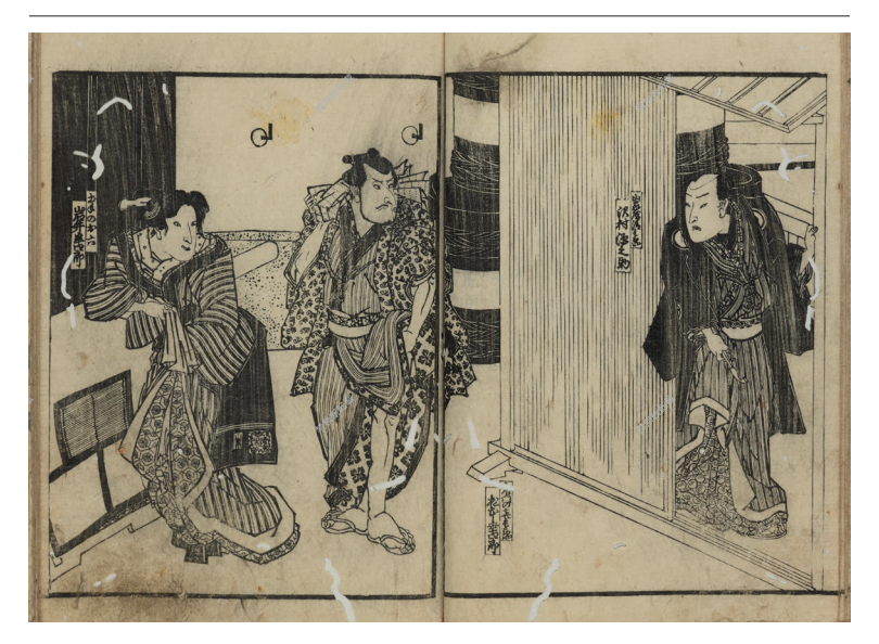
Nanboku/Kunisada, Osome Hisamatsu ukina no yomiuri. 1831. NIJL Nihon Kotenseki Sōgō D.B., 22.3 × 15.4 cm. Senshū University Library, Kawasaki-city (Kanagawa-ken).

itinerary hairdresser, Kyūsaku appears, and asks Oroku to fix his torn kimono too. He also asks the hairdresser to fix his topknot, as his hair is in disarray after the fight. He tells the hairdresser about the fight at the pawn shop, while Oroku and Kibē listen intently, thinking of a plan of how to extort money from the pawn shop using Kyūsaku's torn kimono as evidence. After Kyūsaku leaves, Kibē places the corpse of the runaway shop assistant from the first act, who apparently died of blowfish poisoning. Kibē makes a wound on the corpse's face [fig. 4], and after that, has it carried to the Aburaya pawnshop, where Oroku loudly laments that the shop clerks killed her younger brother in a fight and demands compensation. But just then, Kyūsaku, who is supposed to be dead, appears. To that, the apparently dead shop assistant is revived with the help of some medicine and the fraud unravels [fig. 5].