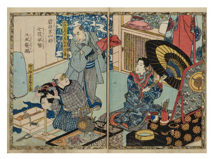
Figures 1-2 Nanboku/Kunisada, Osome Hisamatsu ukina no yomiuri. 1831. NIJL Nihon Kotenseki Sōgō D.B., 22.3 × 15.4 cm. Senshū University Library, Kawasaki-city (Kanagawa-ken).