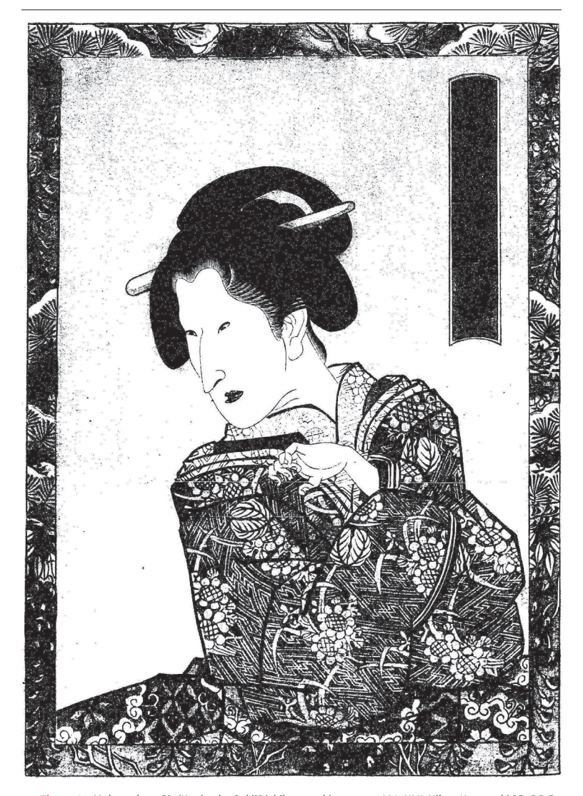
Figure 6 Mokumokugyōin/Kunisada, Gekijō ichikan mushimegane . 1830. NIJL Nihon Kotenseki Sōgō D.B., 22.2×15 cm. NIJL, Tachikawa-city (Tōkyō).