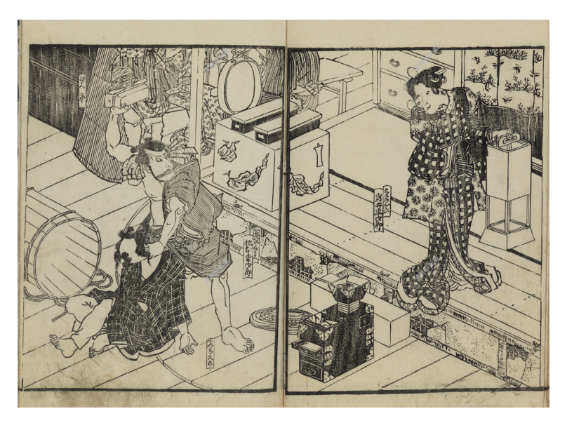
Figures 3-4 Nanboku/Kunisada, Osome Hisamatsu ukina no yomiuri. 1831. NIJL Nihon Kotenseki Sōgō D.B., 22.3×15.4 cm. Senshū University Library, Kawasaki-city (Kanagawa-ken).