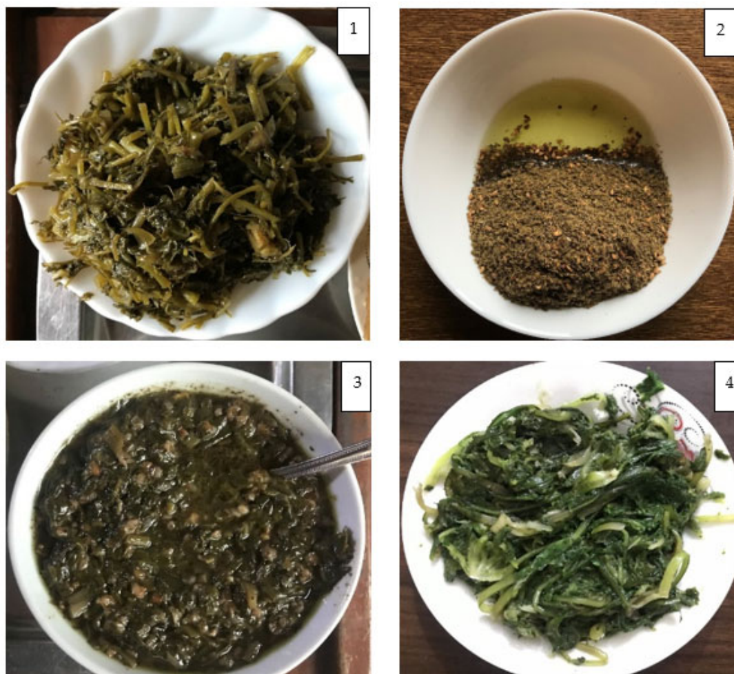
Figure 2. The most popular wild plant-based dishes. (1): Sleeq dish; (2): Zaatar dish with olive oil; (3): Louf soup; (4): Shabshuleh dish.

The young aerial part of Cichorium intybus is boiled for around half an hour, then olive oil, crushed garlic, and a little bit of lemon juice are added (Figure 2). It is typically consumed between January and April before Cichorium intybus starts flowering.