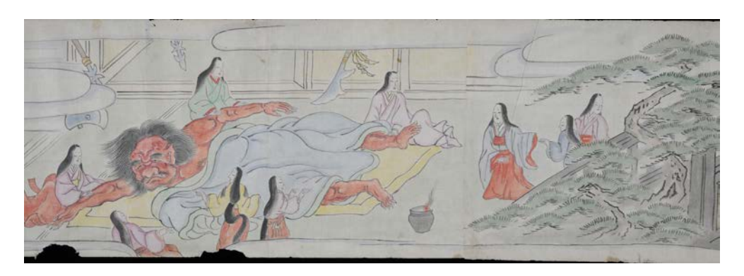
Figure 1b. Shutendōji ekotoba (3 kan 巻), vol. 3 ( ge 下). Kuchinashi Bunko, Kyushu University. <a href="http://hdl.handle.net/2324/1445912">http://hdl.handle.net/2324/1445912</a> (image 8).