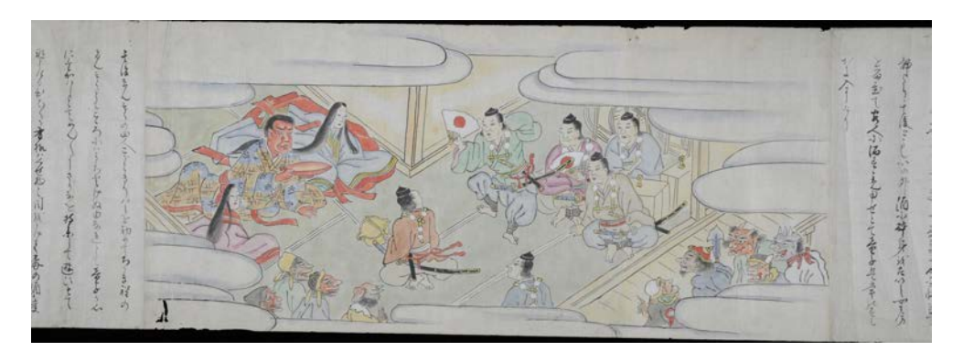
Figure 1a. Shutendōji ekotoba 酒吞童子絵詞 (3 kan 巻), vol. 2 ( chū 中). Kuchinashi Bunko 支子文庫, Kyushu University. http://hdl.handle.net/2324/1445911 (image 17).