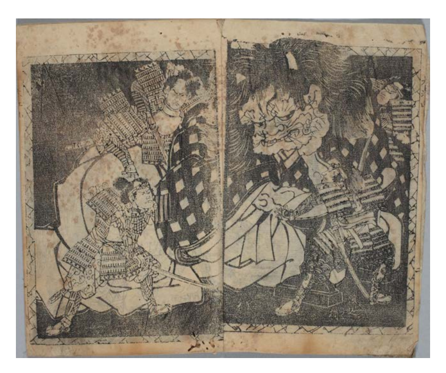
Figure 5. Raikō Ōeyama iri 頼光大江山入. National Institute of Japanese Literature.

https://doi.org/10.20730/200016651 (image 4).