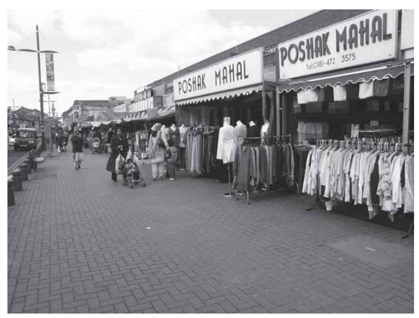
Photograph 1.1: Green Street

▶ East Ham High Street North: a kilometre to the east of Green Street but running on the same north–south axis; this is a semi-pedestrianised street with major national chain stores. The few independent shops are mainly run by ethnic minorities.