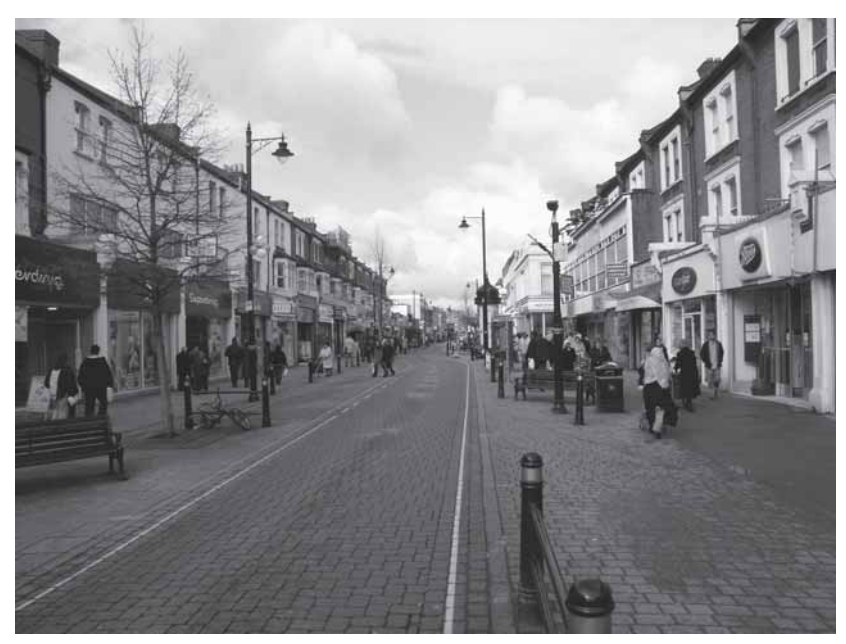
Photograph 1.2: East Ham High Street North

▶ East Ham High Street North: a kilometre to the east of Green Street but running on the same north–south axis; this is a semi-pedestrianised street with major national chain stores. The few independent shops are mainly run by ethnic minorities.