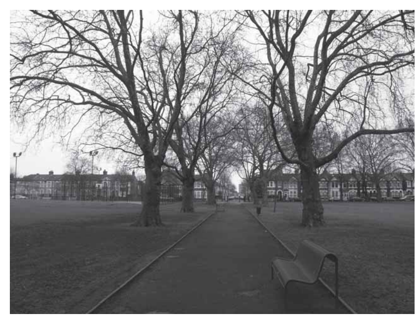
Photograph 1.3: Plashet Park

▶ Priory Park: a small neighbourhood park opened in 1991 (eight acres) with a sports court and playground located between a council estate and private terraced housing. It is used primarily as a sports field but is also a space of transit between houses and nearby main streets.