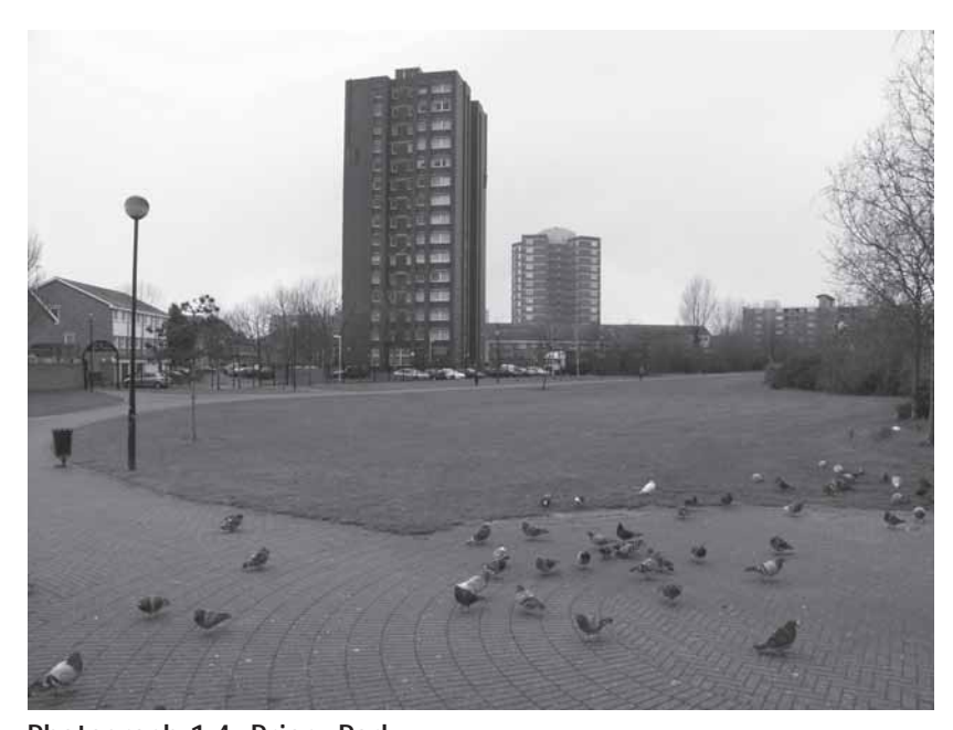
Photograph 1.4: Priory Park

▶ Priory Park: a small neighbourhood park opened in 1991 (eight acres) with a sports court and playground located between a council estate and private terraced housing. It is used primarily as a sports field but is also a space of transit between houses and nearby main streets.