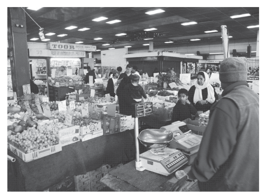
Photograph 1.5: Queens Market

▶ East Ham Market Hall: located off East Ham High Street, this market consists of a series of roofed arcades with fixed stalls and kiosks selling a wide range of products, from foodstuffs to clothes and electronic equipment. It is open from 9am to 5pm, Mondays to Saturdays.²