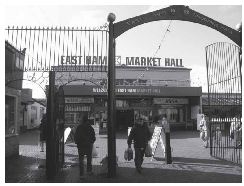
Photograph 1.6: East Ham Market Hall

▶ East Ham Market Hall: located off East Ham High Street, this market consists of a series of roofed arcades with fixed stalls and kiosks selling a wide range of products, from foodstuffs to clothes and electronic equipment. It is open from 9am to 5pm, Mondays to Saturdays.²