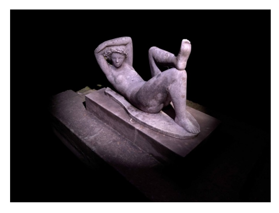
Figure 2. 3D model of Repouso (1953) by Gustavo Bastos, in MFBAUP, one of the selected sculptures studied in BIONANOSCULP.

Nowadays it is also crucial to establish a knowledge database that includes 3D virtual models that can help explaining the objects [3]. These modeling process is important for mapping the state of biodeterioration and biocontamination, allowing the aquisition of details by the viewer that with a 2D image is not possible, namely in interfaces of materials and different surfaces. The data acquisition technique used is a type of photogrammetry, the structure from motion (SfM) technique. The photogrammetric 3D model was generated using Agisoft Photoscan® (http://www.agisoft.com/). This type of acquisition has the advantage of producing a photorealist 3D models of the sculptures. This characteristic is very important for mapping with accuracy the several locations where the nanomaterials will be tested. The photogrammetric models are then post-processed with Blender, a free and open source 3D creation suite software with GNU General Public License (www. blender.org). Figure 2 depicts a 3D model of Repouso (1953) by Gustavo Bastos.