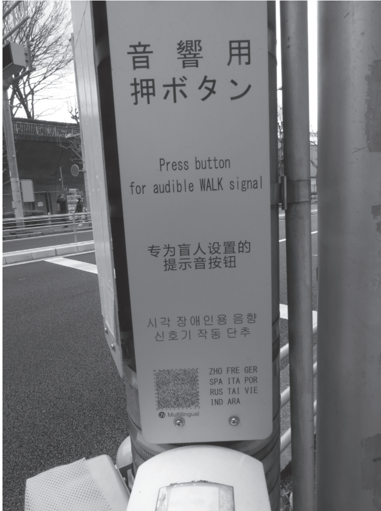
Figure 8.2 An audible traffic light signal next to the Olympic Stadium

assemblies' pictogram. These two examples demonstrate that pictograms do not completely work on arbitrary conventions (such as red signalling prohibition or danger), but use similarity (iconicity) to convey a message. No loud music, for example, happens to be difficult to convey in this way.