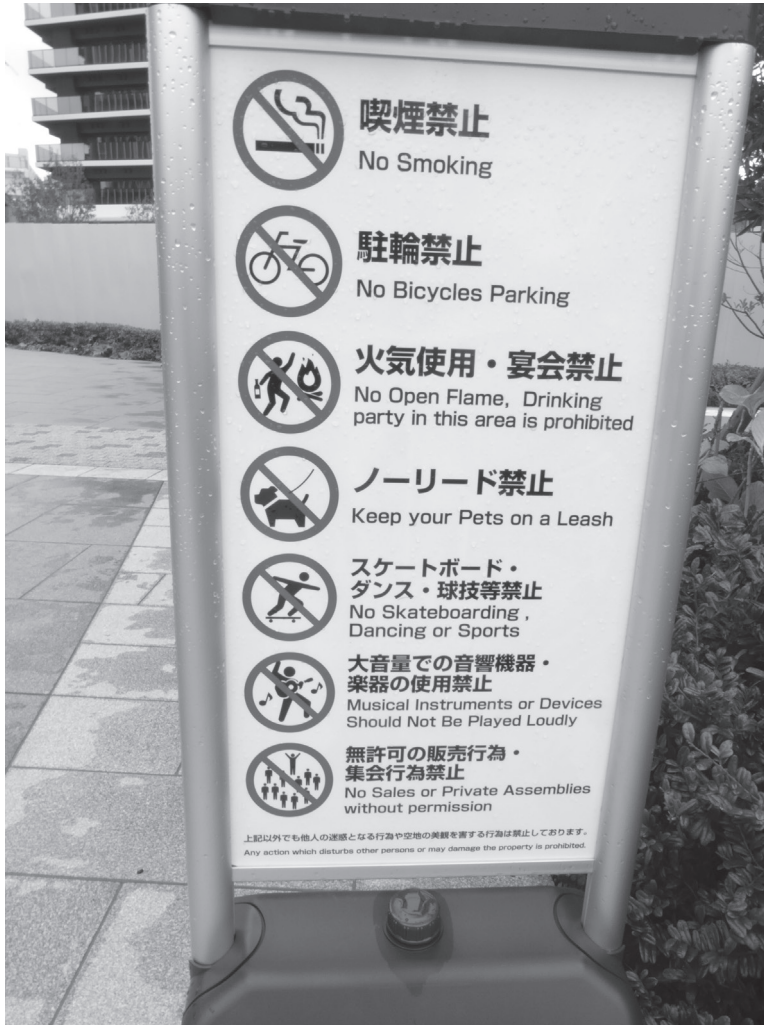
Figure 8.3 The prohibitions in front of the Japan Olympic Museum