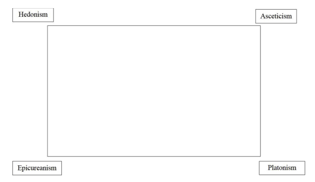
Fig. 1. Graphic representation of the ideological stances in celebrity chefs' websites.

It is worth recalling that the concepts of 'pleasant' and 'indulging' are subjective, especially when applied to personal taste about food, which can make a recipe unpleasant or unsuitable for some, but delicious and appealing for others. Bearing in mind this