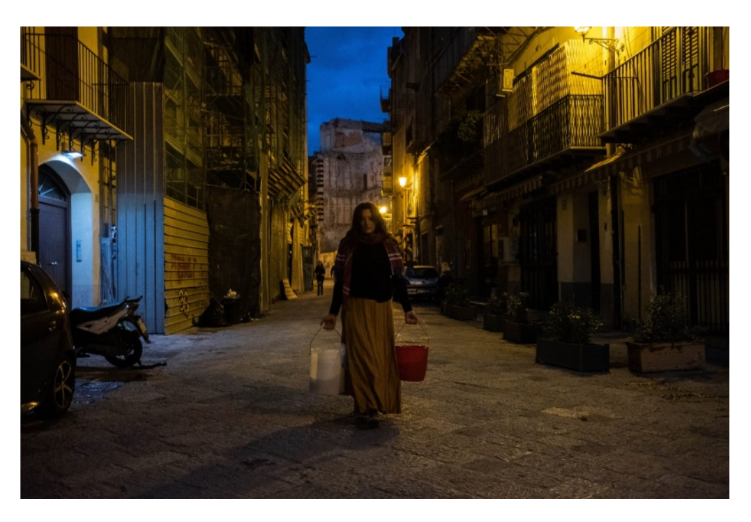
Fig.5. Film-still from Tiziana Pers' ART_HISTORY/Vucciria

and immediate, unfolds different perspectives and raises many questions, such as whether it is possible to give an economic value to life or to an artwork; or even further, whether art has the possibility to rescue lives. The performance took place in two specific moments: at first Tiziana Pers was at the Vucciria, the famous marketplace of Palermo (Sicily), where she urged merchants to bargain a fish with its painting. Secondly, the artist painted the animals to be saved, nine in total, to fulfill the contract with the merchants and later free the fishes on the seafront of Palermo.