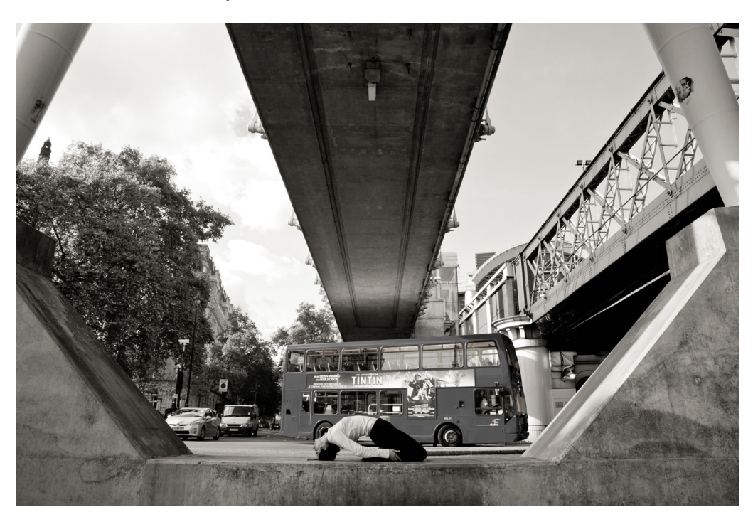
Fig.4. Film-still from Oriana Haddad's Make My Skin

outcome of the project is a photographic collection of urban practices and performances composed of 6 photographic series, which represent the research on 6 different public locations around the City of London.