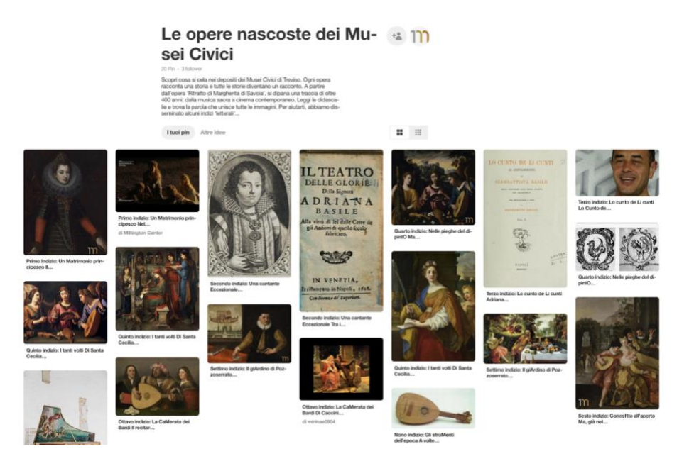
Figure 4: The hidden artworks of the collections board on the Civic Museums' Pinterest profile

in dialogue – through the mechanism of 'pins' – with other visual, audio, textual materials existing in the Web, such as videos, films, books, other images, recordings, in a multidisciplinary and sometimes multisensorial narration around a specific inspiring theme.