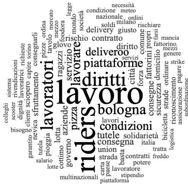
Fig. 4 – Word cloud of 100 most used word in Riders Union Bologna Facebook page (October 2017-April 2019)

protecting workers and promoting an ecological and sustainable mobility». After this, the municipality has called together the main platforms operating in the city at that time (Just Eat, Deliveroo, Glovo, Foodora and Sgnam) and later elaborated the «Bill of Rights of Digital Workers in Urban Contexts».