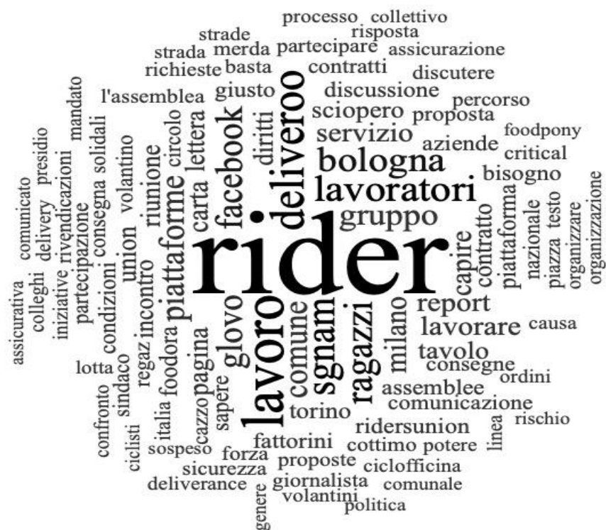
Fig. 1 – Word cloud of 100 most used word in Riders Union Bologna Whatsapp group (October 2017-2018)

Source: Riders Union Bologna what's app group