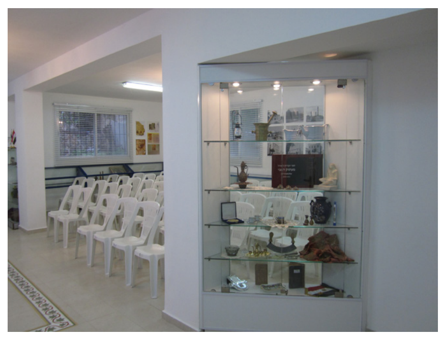
Figure 3. The World Heritage Centre for Egyptian Jewry, Tel Aviv

Similarly to Goshen's bulletin, also Bney Hayeor - which subsequently changed its name into Yetziat-Mitzrayim shelanu (Our exodus from Egypt) - consists of texts informing on the activities of the association, articles, short stories and poems by the association's members. Here and in other texts and autobiographies by Egyptian Jewish Israelis (Miccoli 2014a), heritage is evoked both through monuments and places, as well as feelings: "the Kasr-El-Nil bridge [of Cairo], the Japanese garden, the Café Groppi on the corner, the Pyramids where we went every week [...] the pleasant life, the happy youth, the dynamic and cosy family life, [...] the exotic perfumes, the sound of Eastern music ... " (Azriel 2014, 30-31). As in the case of other diasporas (Bahloul 1983), cookery seems to be an essential component of the community's heritage, as it allows reconnecting to lost flavours and memories of domestic life. So, the Hitahdut's president published a book entitled Mi-ta'amei Mitzrayim (The flavours of Egypt), dedicated "to my mother [...] who taught me not just the taste of good food, but also the substance, beauty and essence of life. And to my two sabra [i.e. Israeli]