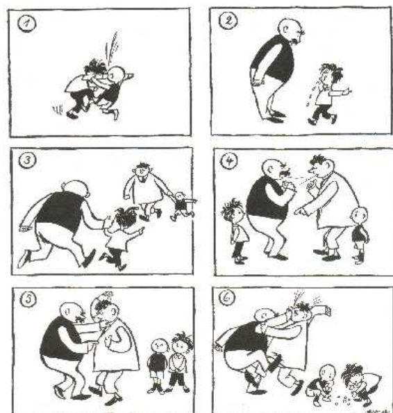
Figure 1: Extract from "Vater und Sohn" (Plauen 2000)

The materials used as stimuli for the picture-based narration tasks are wordless comic strips illustrated by Plauen (2000). Plauen's illustrations are generally self-explanatory and do not give rise to interlinguistic influences since they do not contain any written text.