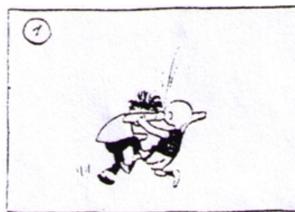
Figure 5: First-mentioned referents (new-discourse information)

The data collected during the narration tasks and elicitation reveal that the position of cardinals may be influenced by information structure. New-discourse information (e.g. first-mentioned referents) can be conveyed by both orders (i.e. Card>N and N>Card), whereas old-discourse information (i.e. already-mentioned referents) is compatible with N>Card only. The former is illustrated in the first panel of the comic strip, shown here in Figure 5; the latter in the fifth panel, shown here in Figure 6.