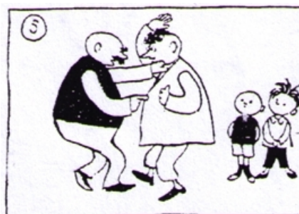
Figure 6: Already-mentioned referents (old-discourse information)

When the children are first mentioned we observe both orders Card>N and N>Card, while in further mentioning only the N>Card order is found.