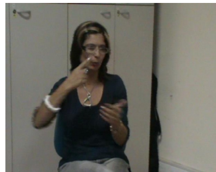
Figure 4: ONE as cardinal numeral

Figure 4 shows the realization of cardinal ONE in sentence (4). In this latter case, eyebrows are in neutral position and the head is not backward tilted.