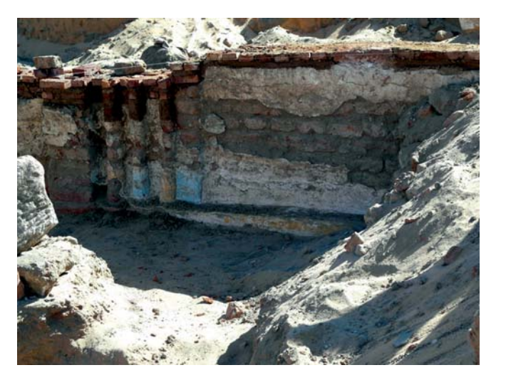
Figure 10. The plaster cover of the eastern façade (2012 season).