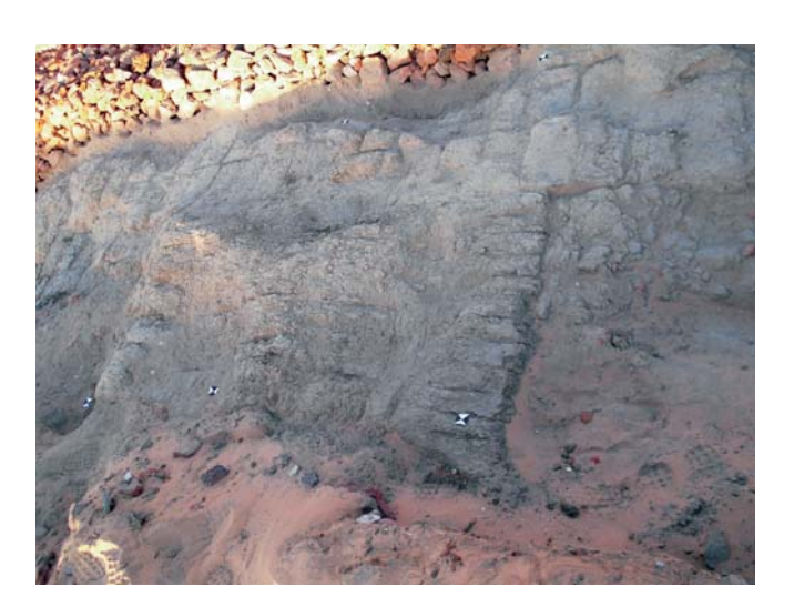
Figure 17. Inner structure of the southwestern sector of the palace platform (2013 season).

ings in Napata were severely plundered of any precious material, and the few still-standing structures were reused as dwelling places by local people; such a historical phase is also testified by some disturbed burials