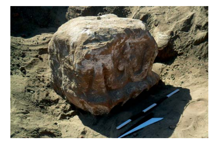
Figure 11. The capital found near the podium (2012 season).