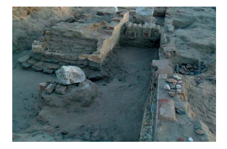
Figure 9. The fallen outer wall between the façade and the podium (2012 season).

probably accessible by means of a mobile (wooden?) structure<sup>10</sup>. The position of this original structure appears to stress a path towards the area of the temple. The lack of any information regarding a hypothetical dromos , south of the palace, does not allow us to suggest any reconstruction of the area between the temple(s) and the Meroitic palatial sector; nevertheless, the position of the stairs, leading to the western entrance of the Palace, and the podium, might clarify the use of the area as a connecting space between the two urbanistic focal points of Meroitic Napata<sup>11</sup>.