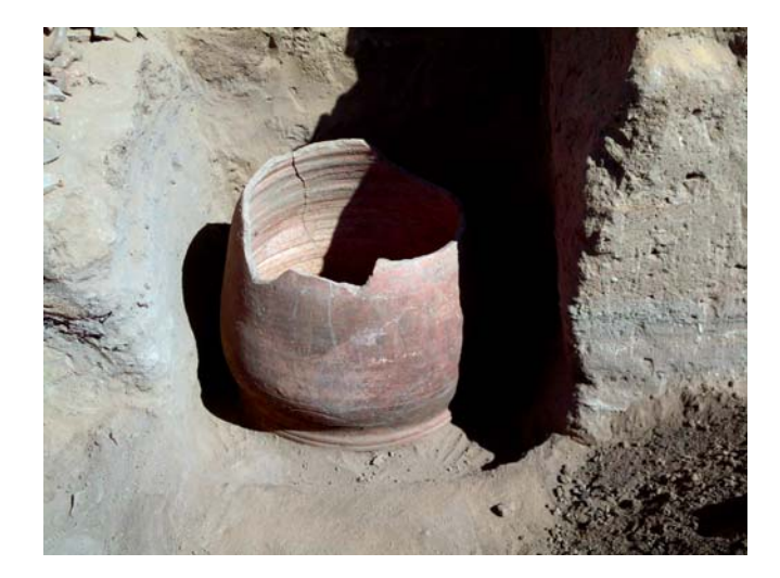
Figure 18. Post-Meroitic oven (2013 season).

excavated in several parts of the buildings in the palatial sector of Napata<sup>21</sup>.