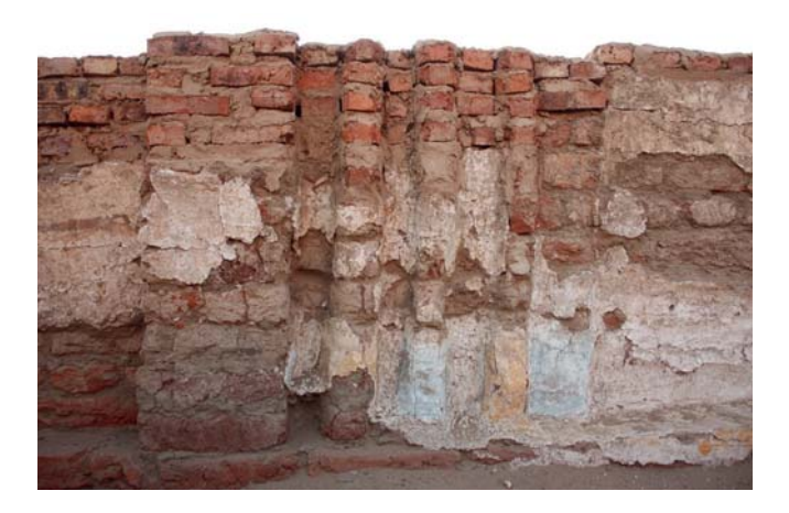
Figure 5. The painted composite buttress near to the western entrance (2012 season).