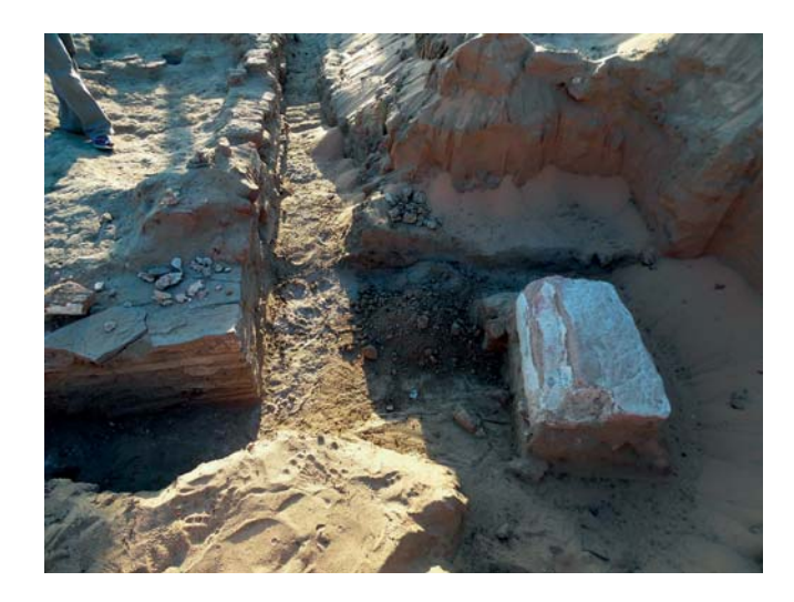
Figure 14. Element of the outer decoration of the southwestern corner (2013 season).