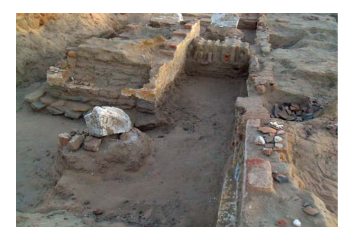
Figure 6. The podium near to the western entrance (2012 season).