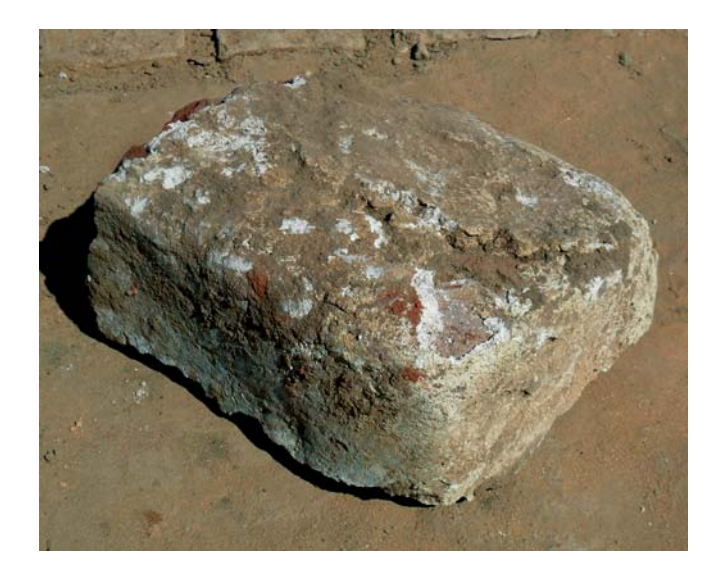
Figure 8. A plastered red brick from the podium (2012 season).