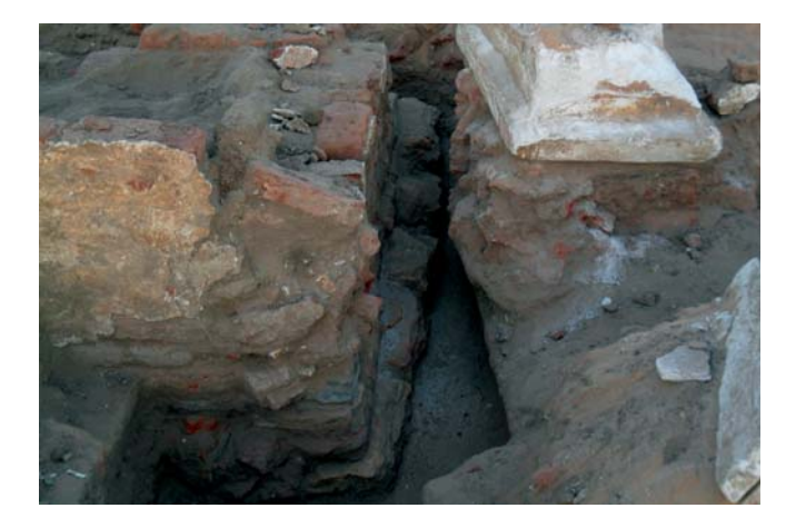
Figure 7. The stone foundations of the podium (2012 season).