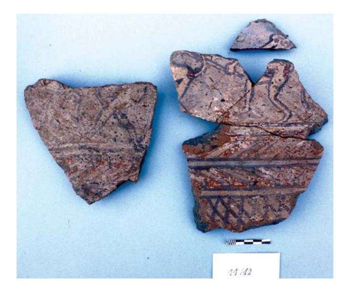
Figure 12. The monkeys in the decoration of some vessel fragments (2012 season).