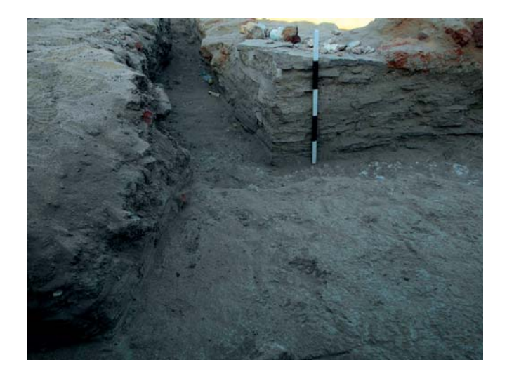
Figure 15. Stone foundations of the southwestern corner (2013 season).

around the palace, leaving a quantity of mud<sup>16</sup>. The position of some decorative tiles, in a lower level, probably testifies to their collapse during an earlier phase of the palace's destruction. All these architectural elements fit with other fragments of the ancient decoration of the façade, such as one red brick, probably part of the torus of the corner, covered by painted plaster. Near the south side of the perimeter wall, a stone corbel from the outer decoration of the façade was discovered; similar architectural elements were used in a similar manner with the sample buttress, in order to mark the level of the palace's floor.