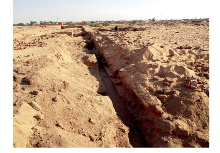
Figure 13. The area of the excavations (2013 season).