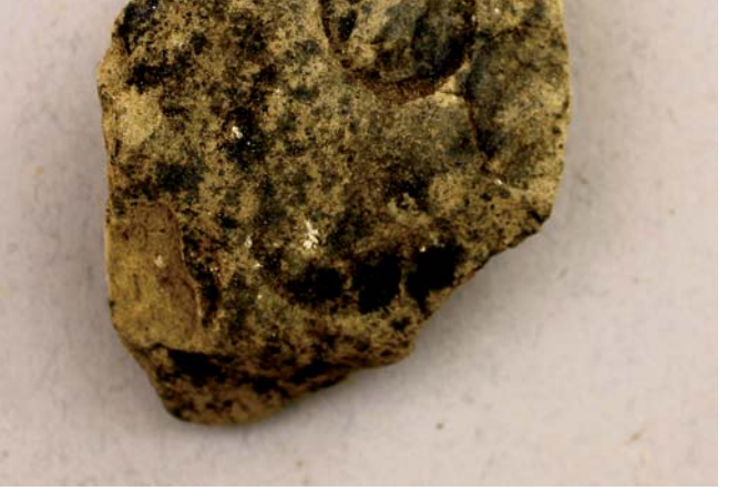
Figure 16. Cretula with decoration: bird of ankh-sign (2013 season).

The destruction of the palace, as already noted, began in antiquity, as confirmed during the excavations of these seasons by the presence of a large oven, located near the juncture between the outer southern facade and an inner wall. This installation, dated to the post Meroitic period, used at least two large jars, whose bottom had been cut away, and turned upside down (Figure 18); the southern one was located on a column drum, clearly not in its original position, and was still filled with ash and bone fragments; the northern oven was built in the same manner, and located on the mouth of an older and larger jar. The regular reuse of the ancient materials is also confirmed by the remains of the original carved decoration, still recognizable in the jar of the northern oven. It probably means that, in the post-Meroitic period, part of the ancient equipment of the palace was still in quite good condition. All the area of the oven was filled with ash, clearly the result of long use; as in other parts of the palatial area, the ancient structures were used as a (temporary) settlement by post-Meroitic populations. It is probable that after the collapse of the Meroitic kingdom, the build-