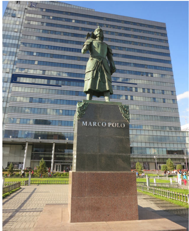
Figure 1. Marco Polo statue in the centre of Ulaanbaatar