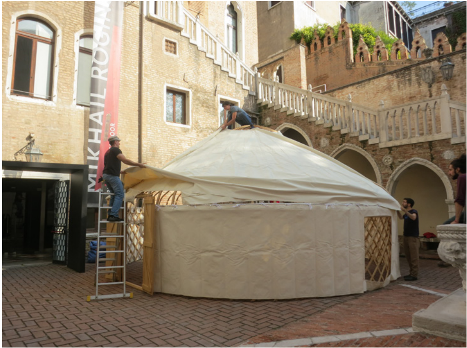
Figure 2. Veneto Night 2014: the yurt is almost ready