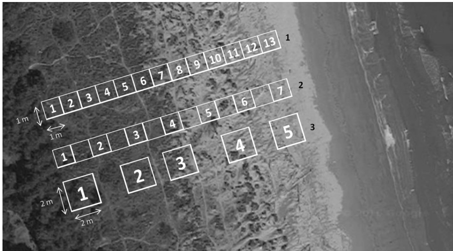
Fig. 1 Design of the three belt transect types used in the study. The picture is not to scale. 1 = Adjacent-plot transect; 2 = Alternate-plot transect; 3 = Zonation-plot transect

diagnostic and dominant species, as listed in Biondi et al. (2009), European Commission (2013) and specific literature (Buffa et al. 2007; Gamper et al. 2008; Sburlino et al. 2008; Prisco et al. 2012; Sburlino et al. 2013).