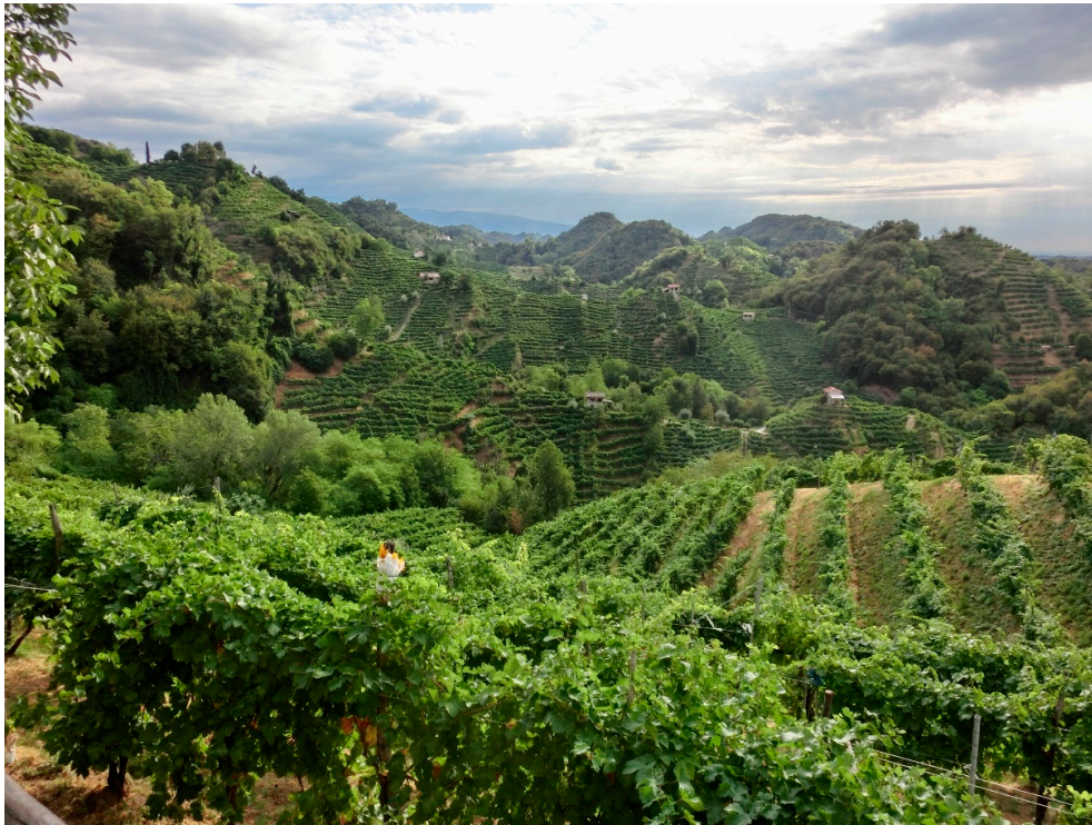
Figure 3. A view of morphological complexity of the reliefs with the different visual elements harmoniously arranged within a scenery of undisputable attractiveness. It is worth noting the remarkable presence of mesothermal woods, mostly covering the steepest slopes and the top sector of the hilly ranges.