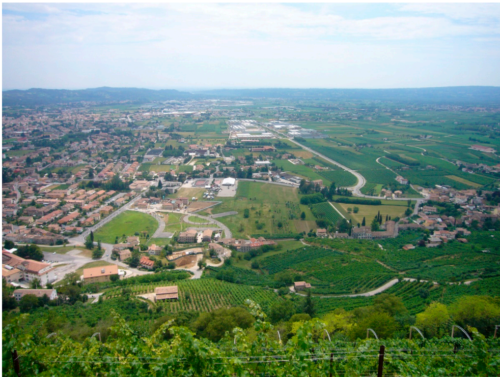
Figure 4. A view from the San Gallo's hill on the urban sprawl between the small towns of Farra and Pieve di Soligo.