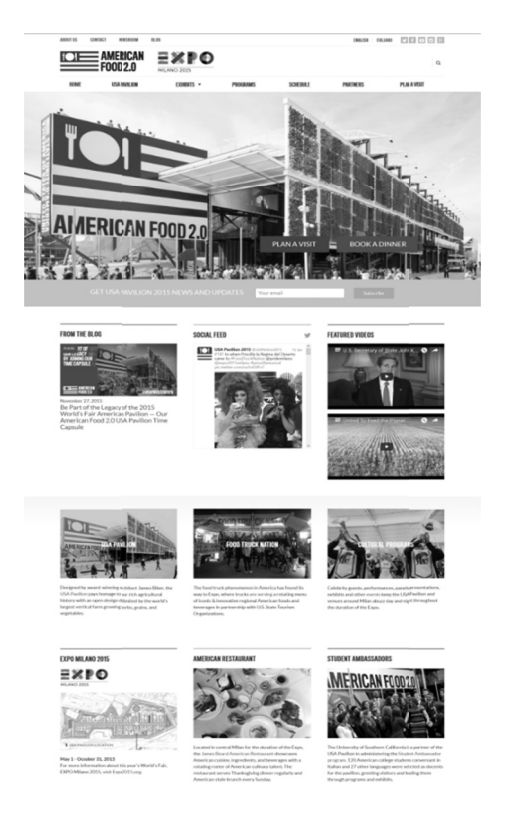
Figure 21.6 Homepage of the USA website

The first image of the USA's website is that of the actual pavilion, which is shown in a full screen picture on the homepage. All sections are easily accessible and immediately visible at the top of the page (Figure 21.6).