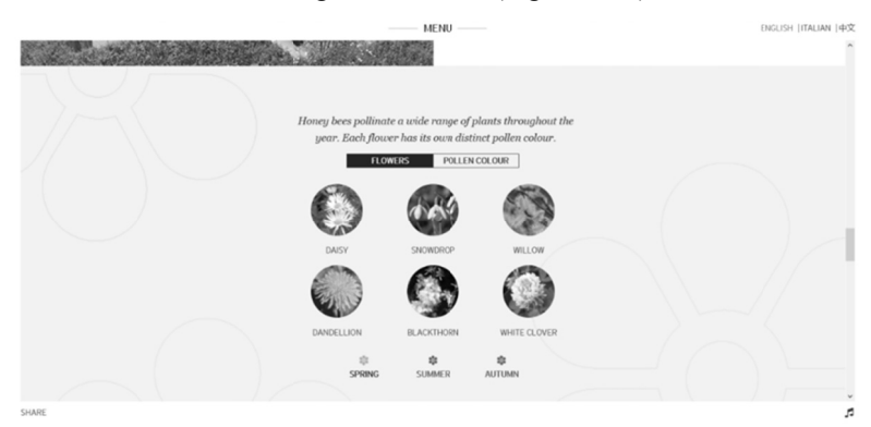
Figure 21.4 Pollen and Plants on the British website

The navigation experience of the website presenting the British pavilion is organised as a guided walking tour of an orchard. The idea of the "British orchard" is further developed with a section that displays the colours and flowers in the UK according to the season (Figure 21.4).