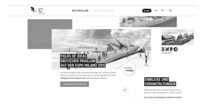
Figure 21.1 Homepage of the German website

Germany seems to provide the most "intellectual" experience with particular attention given to its environmental commitment. The main theme of the pavilion itself, "Field of ideas", helps construct the image of Germany as an innovative and enthusiastic country, which is also described in terms of desire for novelty. The website promotes innovative projects as well as political, economic and research initiatives but also the citizens' involvement in its projects. In fact, the activities in the pavilion encourage visitors to collaborate with the German initiatives, which include a conscious and more efficient usage of natural resources as well as the development of innovative ideas for an "urban farm". The visitor's attention is caught thanks to an engaging and interactive website: navigation can be done through Prezi-like paths (Figure 21.1) that guide the visitor through a virtual tour of the pavilion, structured as an exhibition ( Die Ausstellung ).