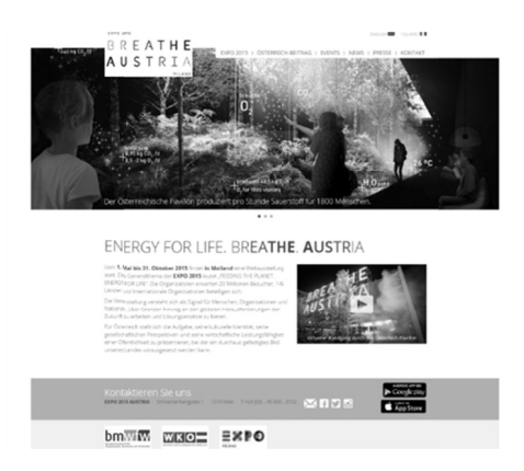
Figure 21.2 Homepage of Austria's website

The aim of the Austrian website is to reinforce the country's worldwide reputation of an attractive and beneficial place worth visiting. It promotes itself as a "green nation" that has achieved this status with the elimination of air and water pollution, by stopping deforestation and preserving its eco-system. The forest is the leading theme of both the pavilion and the website. The senses of the visitors are stimulated through background music with the sounds of nature while they undertake a journey of discovery "immersed in the green" (see Figure 21.2).