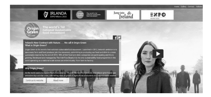
Figure 21.5 Homepage of the Irish website

Ireland's Expo website focuses on the role that countries in the North Atlantic area play in preserving wildlife and natural resources; it is, indeed, the least "Expo-centred" of the websites analysed in this study. Compared to the British website, the Irish one is quite factual and far less creative, more focused on the general commitment to the sustainability theme than on the events or activities organised for the Expo (Figure 21.5). In addition, the sections contain a general description and presentation of their contents with a minimal usage of multimedia elements limited to a link to a video on the homepage and to the background pictures of each page. The image of Ireland emerging from the visual analysis of its Expo website is that of a country full of wildlife that commits itself with rigour and professionalism to the preservation of the environment and its resources