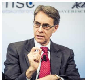
Kenneth Roth

a crime. Over the past several years, hundreds of rights activists have been detained in China. (See the China Story Yearbook 2015: Pollution , Chapter 2 ‘The Fog of Law’, pp.67–85, and the China Story Yearbook 2016: Control , Chapter 2 ‘Control by Law’, pp.43–57.) In September 2017, Kenneth Roth, the director of Human Rights Watch (HRW) went as far as to declare that ‘Chi-