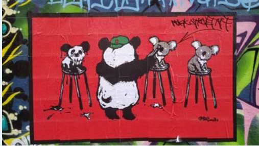
Another Badiucao cartoon in Hosier Lane

in Melbourne's graffiti-covered Hosier Lane. After Liu's death, he added a second image of him ascending into heaven, with a halo on his head and his slippers discarded on the ground. The Hosier Lane site quickly became a shrine, with people leaving flowers and other offerings (see photo) and the images went viral. Because they are relatively abstract, activists in China briefly got away with posting them on the Internet.