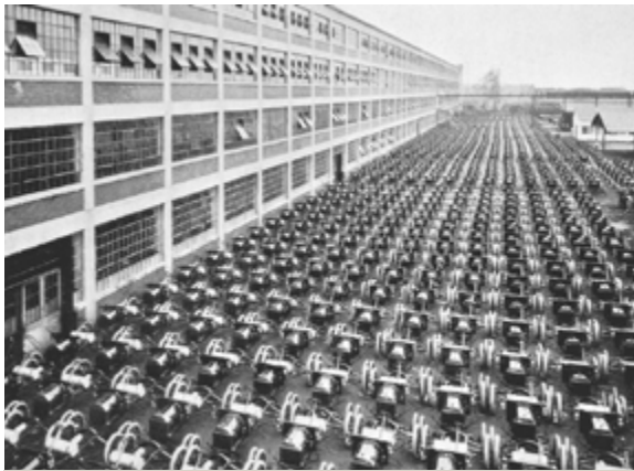
Highland Park Ford Plant, the first factory in history to assemble cars on a moving assembly line.

Our Future , intellectuals have turned to these interpretations in order to compensate for today's social and political impasse. Liberation from labour and the 'struggle to be human and educated during one's free time', emerge in Mason's analysis as the vision of a post-capitalist society that can grow inside the old one.