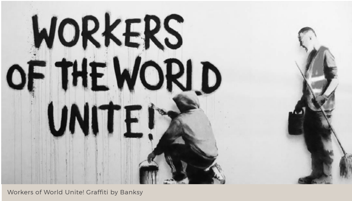
Workers of World Unite! Graffiti by Banksy