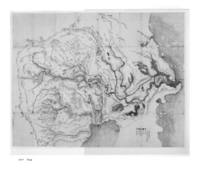
Fig. 3) Water route map of Kantō Region, 18<sup>th</sup> century (Funabashi Municipal Library)