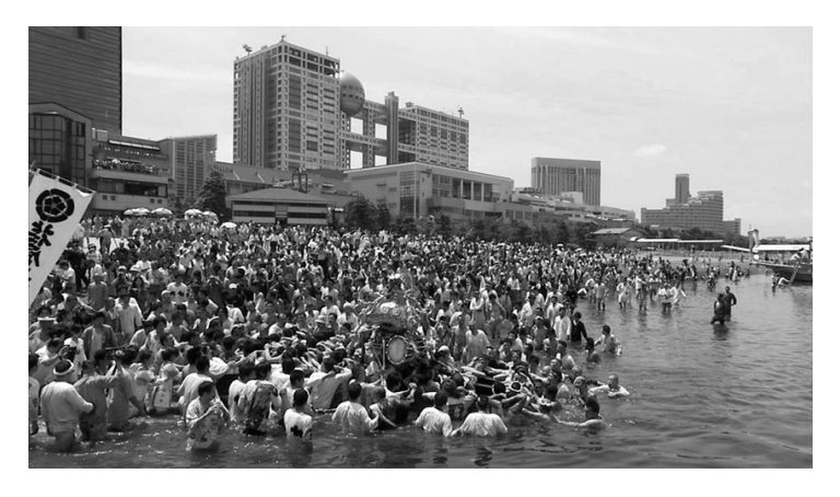
Fig. 4) Procession in the water with portable shrine (Laboratory of Regional Design with Ecology, Hōsei University)