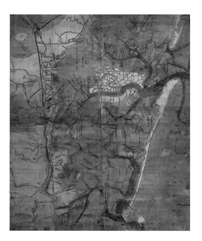
Fig. 1) Lagoon of Venice, 16<sup>th</sup> century (Archivio di Stato di Venezia, 35/2017, Savi ed esecutori alle acque, Disegni, Diversi, n. 128/3)

The following volume on water cities (Suitogaku) aims to explore these topics in greater depth.