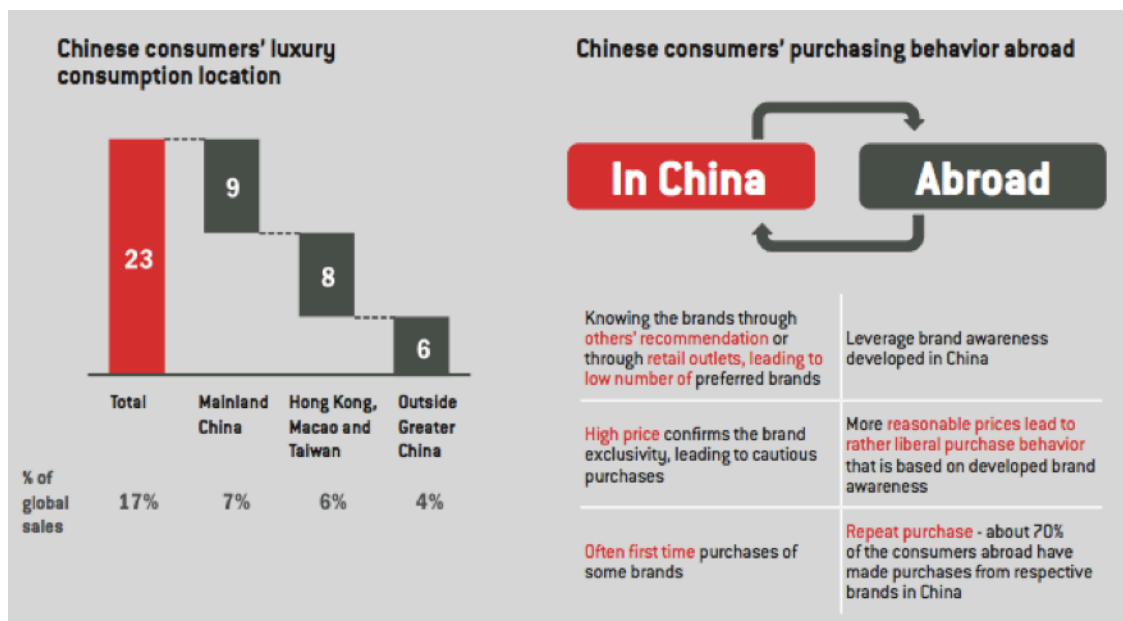
Exhibit 1. Chinese consumer's purchasing behavior abroad