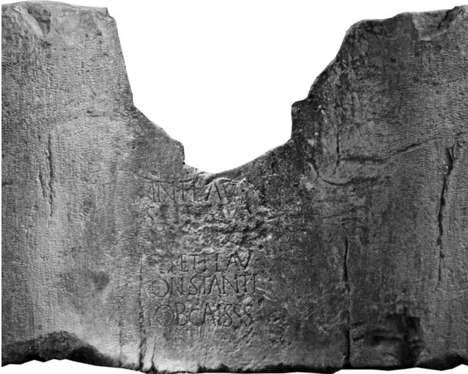
Fig. 1. Digital unwrapping of the milestone surface (G. Trombin)

When referring to any of these three groups of Caesars, official documents, such as milestones and other public inscriptions, mention their names according to the order in which they are listed above. 4