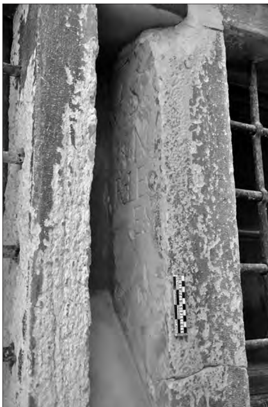
Fig. 1. The newly discovered fragmentary inscription