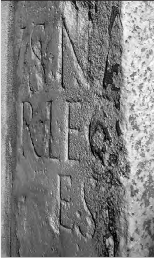
Fig. 5. Detail showing palaeographic features of lines 2-4 of the newly discovered fragmentary inscription

Tacitus, who mentions that in AD 65 levies were held in Narbonese Gaul, Africa and Asia to recruit the legions for Illyricum 26 . At any rate a provenance from Aquileia or the eastern Regio X cannot be dismissed. On the basis of all the considerations that have been discussed so far, the following tentative restoration of the text of the inscription can be proposed: