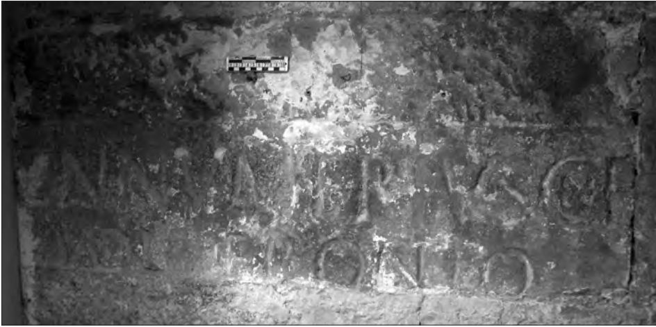
Fig. 6. CIL V, 2162, lines 1-2