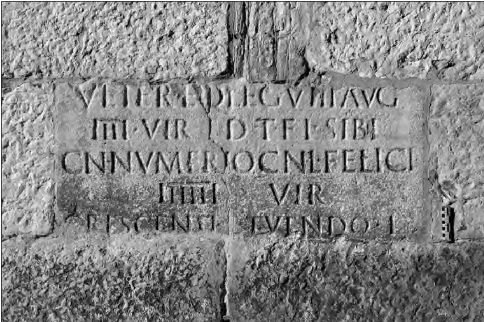
Fig. 7. CIL V, 2162, lines 3-7 (© Oliviero Zane)

Kolonien...», cit. ; ALFÖLDY, «Veteraneneduktionen in der Provinz Dalmatien», in Historia 13, 1964, pp. 167-179; WILKES, Dalmatia , cit. , pp. 220-261; H. GALSTERER, «CIL III, 2733 und die Entstehung der Kolonie in Aequum», in ZPE 7, 1971, pp. 79-91; and, more recently, U. LAFFI, « Quattuorviri iure dicundo in colonie romane», in P.G. MICHELOTTO (ed.), Άγιος άνήρ. Studi di antichità in memoria di Mario Attilio Levi , Milano 2002, pp. 243-262, esp. pp. 253-255 (reprinted in U. LAFFI, Colonie e municipi nello Stato romano , Roma 2007, esp. pp. 139-142).