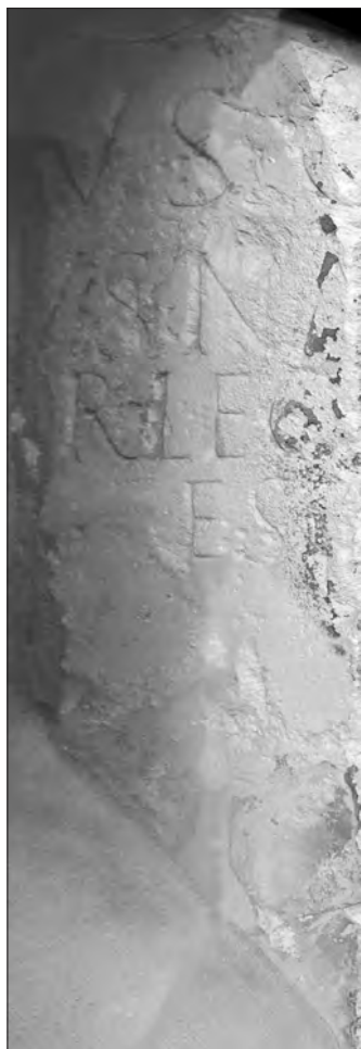
Fig. 2. Rectified and enhanced image of the newly discovered fragmentary inscription