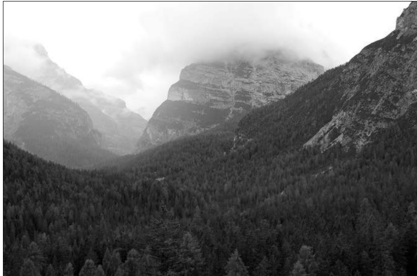
Figure 1. High mountain Norway spruce forest in Boite district, Pian de Loa, Belluno Province, Italy.