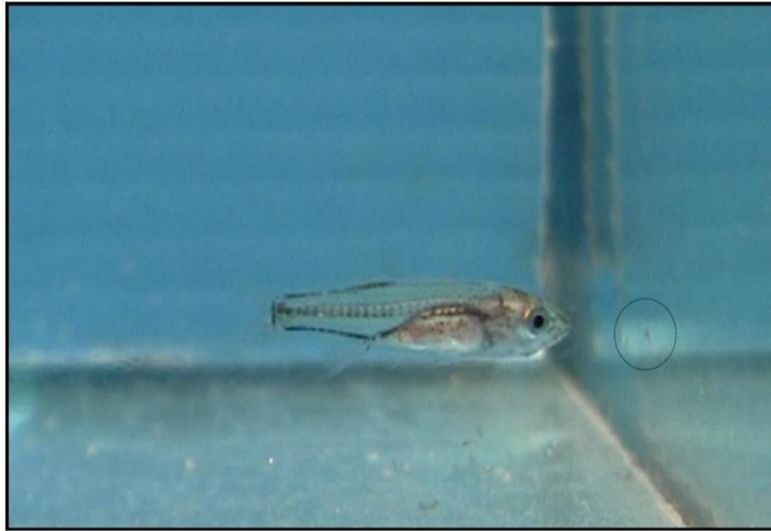
labrax L.) while searching for Artemia nauplii prey.

“experimental tank” remained constant for the whole duration of the experiment.