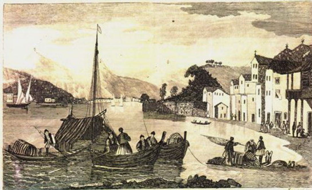
Città e porto di Bathi (Ithaca)