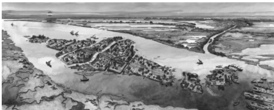
Fig. 1. Comacchio (FE) during the early Middle Ages (reconstruction drawing by R. Merlo).