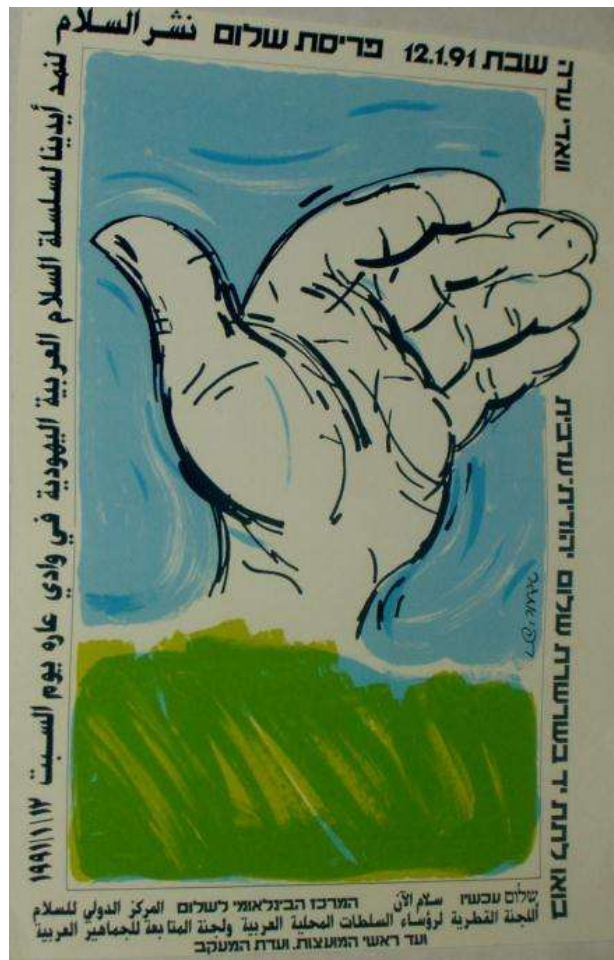
Figure 9: ‘Spreading peace.’ Poster, 70 X 35 cm, design by Rafi Ettinger. Peace Now archive, item # 11 in file # 2,96,120, Yad Yaari Institute, Givat Haviva. Reproduced by permission of the Yad Yaari Institute, Givat Haviva.