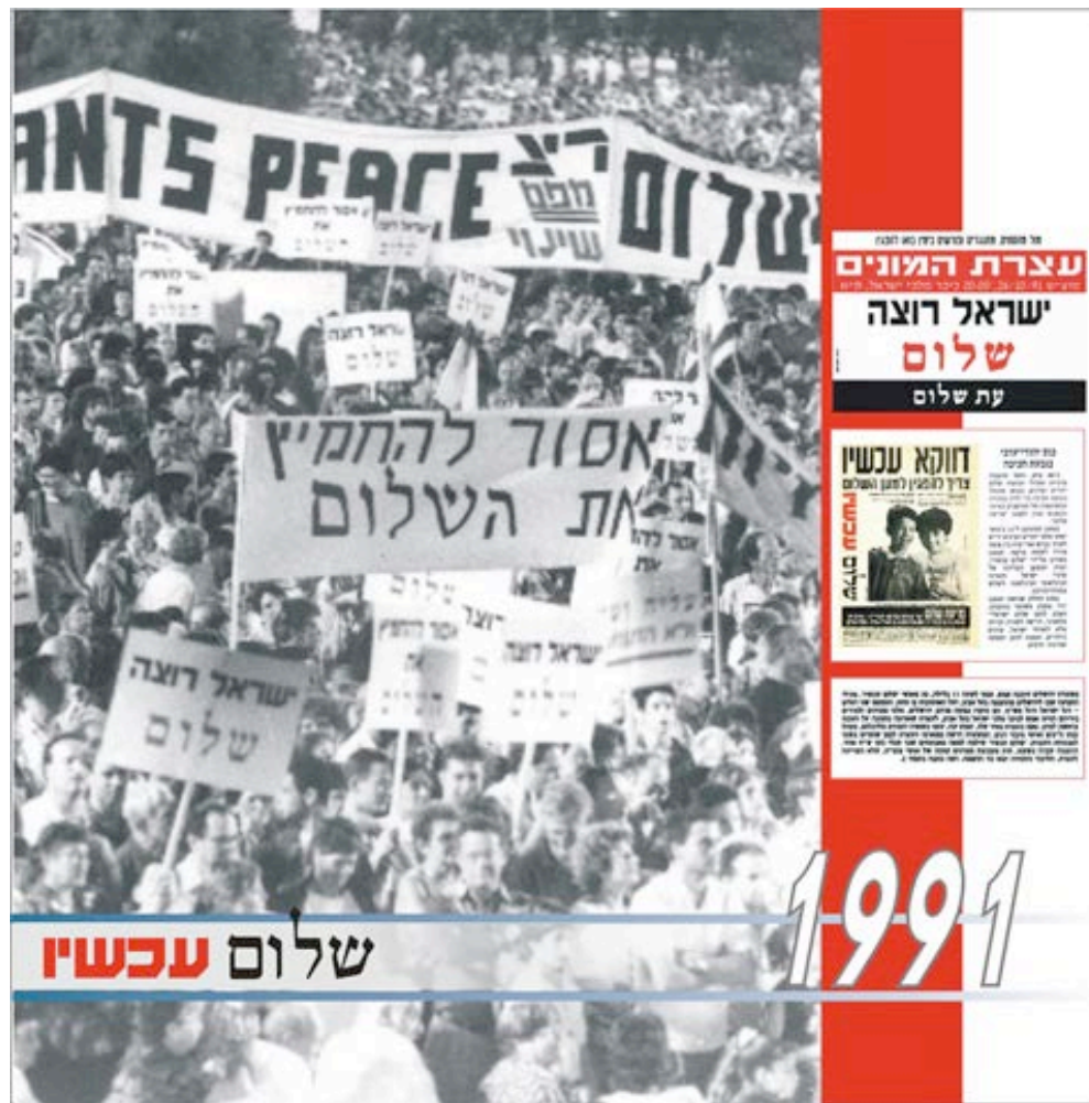
Figure n. 3: Electronic image of a collage representing activities and events in 1991, Peace Now 30 year exhibition. Peace Now archive, catalogue # 7,2,2-121, dvd2, Yad Yaari Institute, Givat Haviva. Reproduced by permission of the Yad Yaari Institute, Givat Haviva.

On the third occasion 'Peace Now' did not need to pressure the government to compromise during negotiations but instead congratulated the government on the secretly negotiated Oslo accords. On 4 September 1993, a large joyous crowd celebrated the agreement in Tel Aviv. 78 The main slogan for the event was 'The People stand for Peace', which had already been circulating in previous months as a response to the widely disseminated right-wing slogan against withdrawal from the Golan Heights, 'The People stand with the Golan.' 79 Additional slogans were also those already in circulation to build