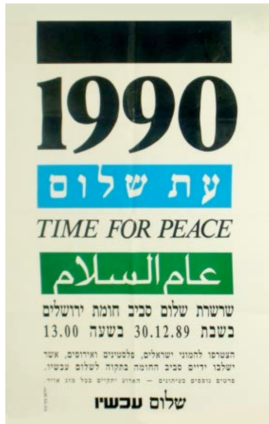
Figure 8: '1990: Time for Peace.' Poster, 70 X 50 cm. Peace Now archive, item # 11 in file # 5,96,120, Yad Yaari Institute, Givat Haviva. Reproduced by permission of the Yad Yaari Institute, Givat Haviva.

In order to promote an image of peace as reconciliation and dialogue there also had to be experiences of those concepts to symbolize. A milestone in 'Peace Now's efforts to bring Israelis and Palestinians together during the first Intifada was an event to create a human chain around the walls of the Old City of Jerusalem. The event was planned over months not only by 'Peace Now' but also by Palestinian counter-parts and European peace activists. 91 Hence, the promotion of the event did not employ the colors of the 'Peace Now' logo, though the large letters reading 'Time for Peace' in Hebrew uses the same font that the word 'peace' was usually displayed in. Blue is used to symbolize Israel colours, and green and black both appear in the Palestinian flag. The theme of temporality is sustained from previous slogans by proposing that peace can be brought in the coming year, and the final phrase of the text at the bottom speaks of joining hands in the hope of peace now.