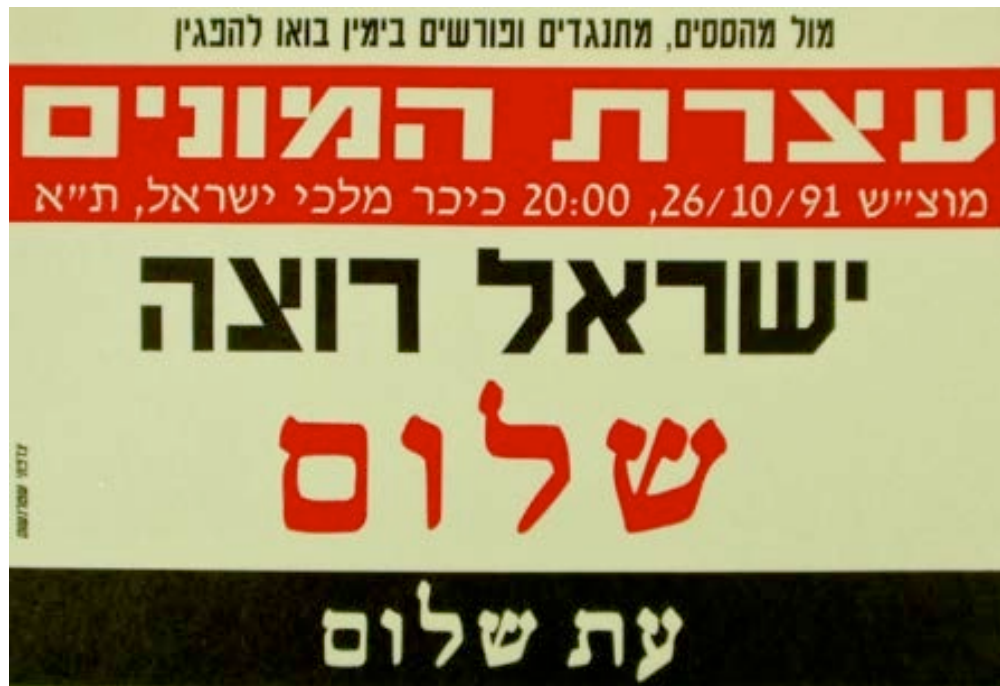
Figure 2. 'Israel wants peace: Time for Peace.' Flyer, Peace Now archive, file # 1,33,92, Yad Yaari Institute, Givat Haviva. Reproduced by permission of the Yad Yaari Institute, Givat Haviva.

the temporality of 'Time for Peace', a phrase borrowed the Book of Ecclesiastes 3, 8. There is also according to the same piece of scripture a time for war. While the post-Gulf War international atmosphere prompted the 'time for peace' sentiment and the Madrid conference, the verse itself suggests that another change in circumstances would justify war.