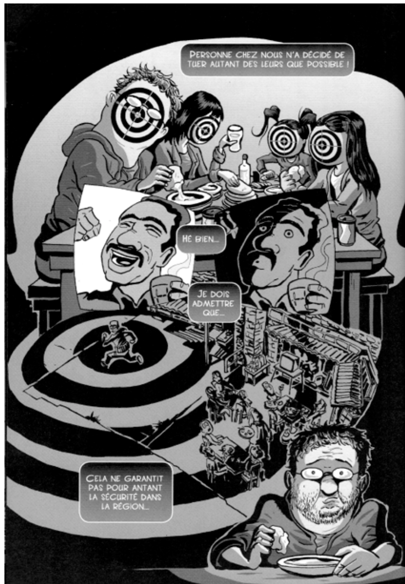
Figure 2: Uri Fink, Israël-Palestine entre guerre et paix , (Paris: Berg International éditeurs & Uri Fink, 2008), n.p., Copyright Uri Fink. Used with permission.

nuanced, condemning terrorism on both sides. The chapters “Panna Cotta” and “Les Fink Combattent le Terrorisme” are particularly powerful as while the latter depicts the Fink-family but also the Palestinians literally as targets, 82 the former takes up Israel’s national trauma, the Rabin assassination, and makes tangible the total despair of the leftwing Israelis as to the upcoming end of the peace-making process. 83