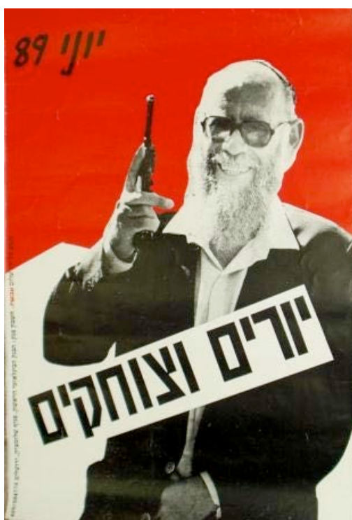
Figure 11: 'Shooting and Laughing.' Poster, designed by David Tartakover, 1989, 96 x 68 cm. Peace Now archive, item # 2, file # 2,96,120, Yad Yaari Institute, Givat Haviva. Reproduced by permission of the Yad Yaari Institute, Givat Haviva.

movement's bank account details for donations). The poster features a photograph of a notorious settler leader, Rabbi Levinger, grinning with pistol in his hand, decontextualizing him against a stark red and white background, while the bold script labeling him reads 'Shooting and Laughing.' The phrase is a variation on the expression 'shooting and crying', which refers to the practice of executing violence and then bemoaning it later. Already the title of a book of columns by journalist Nahum Barnea, the phrase was also the title of a controversial rock song (that was banned by army radio) by popular musician Si Hi-man in 1988, protesting the violent repression of the Intifada. 104 The poster demonizes Levinger, and by implication the settlers in general, as lacking even the conscience to agonize over their violent behavior. As in much anti-occupation imagery, peacefulness is not symbolized by the image, which pictures antagonism to those held responsible for the absence of peace.