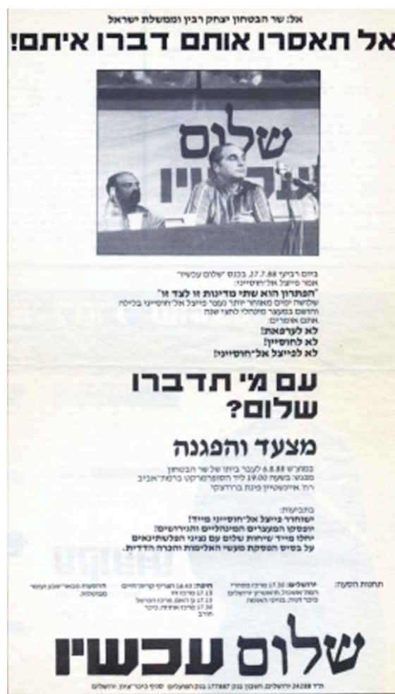
Figure 7: ‘Don’t imprison them – talk with them!’ Detail from electronic image of a collage representing activities and events in 1987, Peace Now 30 year exhibition. Peace Now archive, catalogue # 7,2,2-121, dvd2, Yad Yaari Institute, Givat Haviva. Reproduced by permission of the Yad Yaari Institute, Givat Haviva.

could be brought to conferences with the ‘non-terrorist branch of the PLO’, they would all understand that there was a partner for peace, despite the government’s denials and a law forbidding Israelis to meet with PLO representatives. 89 However, the demonstration in support of Hussein attracted only a few thousand, reflecting the movement’s weakness when confronting Labour rather than Likud politicians, but also the dilemma that ‘Peace Now’ constantly faced in promoting peace as dialogue when the Palestinians were regarded by so many Israelis as hostile and violent. 90 For Hussein to appear to be speaking for ‘Peace Now’, while getting in the way of ‘peace now’, was too much for ‘Peace Now’s’ broader public.