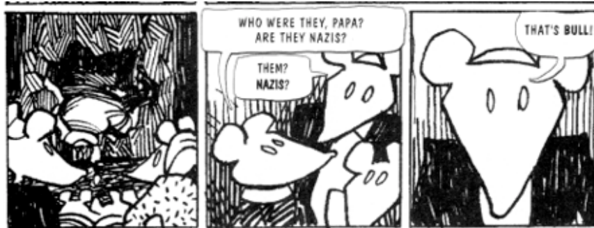
Figure 1: Uri Fink: “Humaus in: Fink! Tales from the Ragin’ Region , (El Sobrante, CA: Hippy Comix, 2002), 10. Copyright Uri Fink. Used with permission.

The father framed in a close up in the last panel of the story answers “That’s Bull.” 76