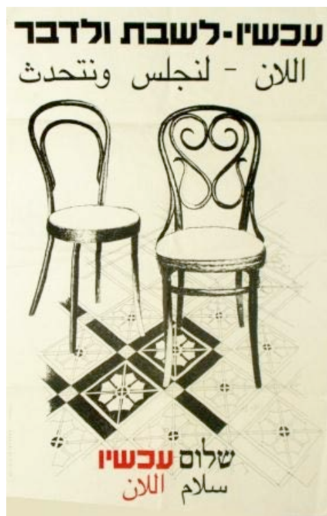
Figure 5: "Now – it's time to sit down and talk." Peace Now poster, 70 X 50 cm, design by Aryeh Agg.

construct an image of peace as negotiation. 81 Such dialogue was a shift in the movement's focus on the Jewish Israeli public, but enabled it 'to build in practice an infrastructure of peace relations.' 82 Above all, 'Peace Now' needed to show that there were Palestinians willing to engage with not only the radical, non-Zionist groups (for whom the official PLO stance prior to 1988 of a secular democratic state in all of Palestine was acceptable) but also with 'Peace Now' as a Zionist peace group. 83 This process had already begun towards the end of 1984, and by 1985 'Peace Now' was already campaigning for dialogue with Palestinians. A poster declaring that 'Now – it's time to sit down and talk' was published at least by January 1985, and retrospectively placed in a collage representing activities for 1987 in 'Peace Now's' 30 year exhibition. 84