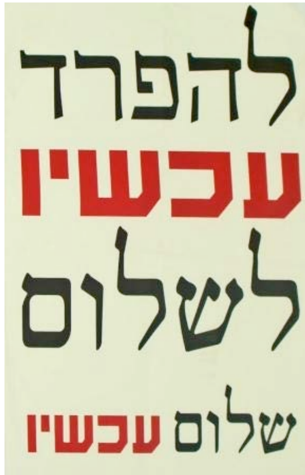
Figure 13: 'Part Ways for Peace.' Poster, 70 X 50 cm. Peace Now archive, item # 16, file # 5,96,120, Yad Yaari Institute, Givat Haviva. Reproduced by permission of the Yad Yaari Institute, Givat Haviva.