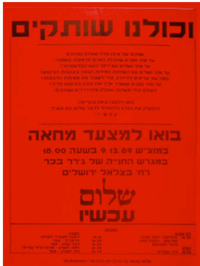
Figure 10: 'And we all remain silent.' Poster, 50 X 35 cm. Peace Now archive, item # 4, file # 8,96,120, Yad Yaari Institute, Givat Haviva. Reproduced by permission of the Yad Yaari Institute, Givat Haviva.

poster has to be read rather than taken in at a glance (as a glance would not reveal the purpose of the demonstration, other than that it is organized by 'Peace Now'). The text suggests a collective civic responsibility for the suffering of the Intifada and for the occupation, while proposing that there is a political alternative of peace. But the image of peace as negotiation is downplayed compared to the implicit understanding that occupation must be ended in order to bring peace now.