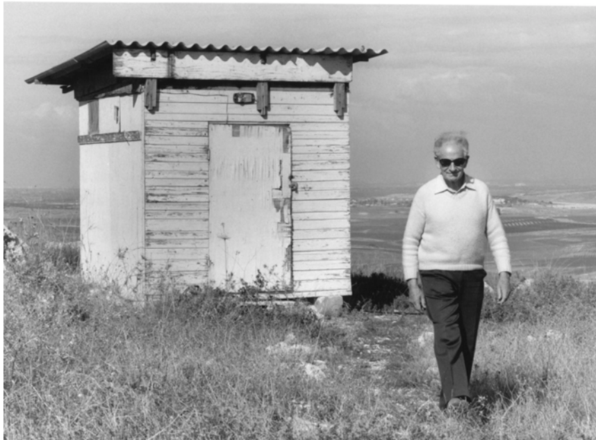
Figure 3: Hussar and the first hut. ASJA