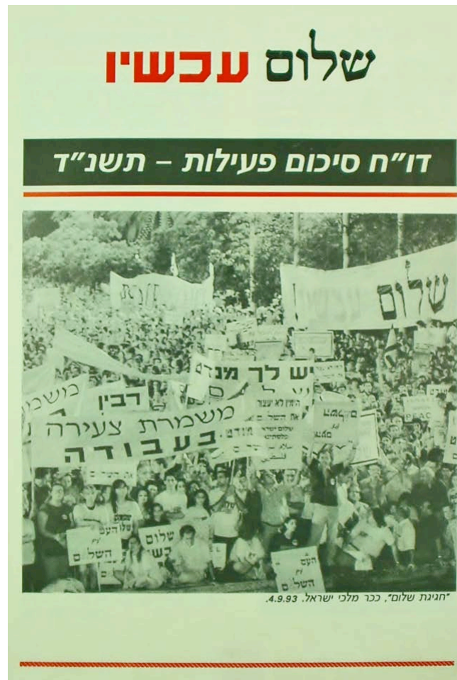
Figure 4: 1993 demonstration. Peace Now ‘Summary report of activities – 1993-94.’

public support for the peace process: ‘there is a mandate for peace’ and ‘the right won’t prevent peace.’ 80 Those slogans can be made out in a photograph of the demonstration that appears on the cover of a ‘Peace Now’ report on its activities, as well as a large banner of the Labor Party’s Young Guard. On all three occasions, ‘Peace Now’ orchestrated an image of massive public support for peace negotiation