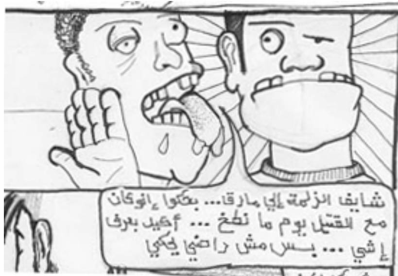
Figure 6: Samir Harb, Oba'den [What Next?], 2 (2008), 3. Copyright Samir Harb. Used with permission.

the third panel of the second page with nice features (but makes him, on the contrary, a little plump and dumb looking). However, neither the victim nor the other characters of the story (e.g. one is spitting in his excitement of being able to chitchat 107 - are drawn as handsome.