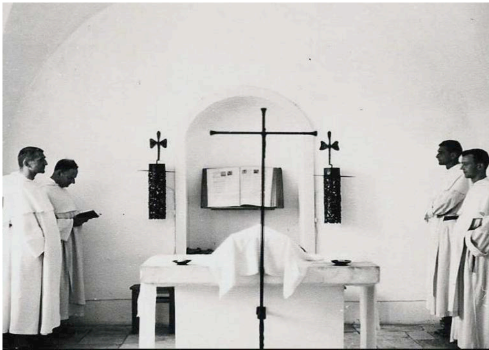
Figure 2: The St. Isaiah House.