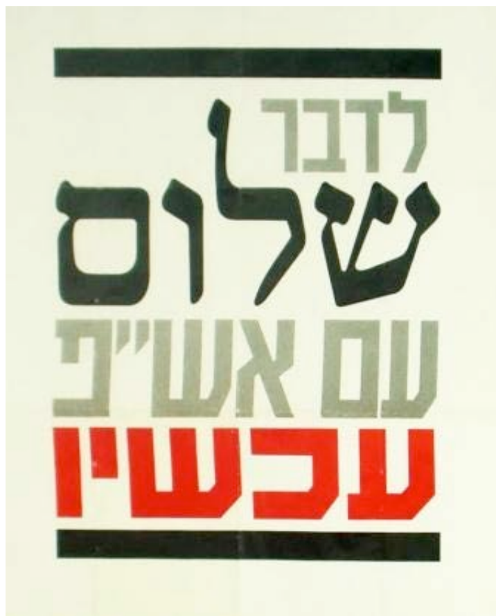
Figure 6: ‘Talk peace to the PLO now.’ Peace Now poster, design by David Tartakover, 87 89 X 57 cm. Peace Now archive, item # 13 in file # 2,96,120, Yad Yaari Institute, Givat Haviva. Reproduced by permission of the Yad Yaari Institute, Givat Haviva.

The government clearly did not agree with ‘Peace Now’'s demand or assessment of the situation, given that it had placed Faisal Husseini, the leading figure of the Palestinians in the Occupied Territories, in administrative detention following a significant conference meeting with ‘Peace Now’ in July 1988 in which he had clarified that an earlier statement by one of Yasser Arafat’s advisers did indeed indicate that the PLO had recognized Israel. 88 Feeling responsible and angry, ‘Peace Now’ organized a demonstration on 6 August 1988 targeting the Tel Aviv home of the Minister of Defence, Yitzhak Rabin of the Labor Party, under the slogan of “Don’t imprison them – talk with them!” The notice for the demonstration features a photograph of Faisal Husseini talking in front of the ‘Peace Now’ banner, as if he were actually speaking for the movement. Indeed, Reshef himself believed that if all Israelis