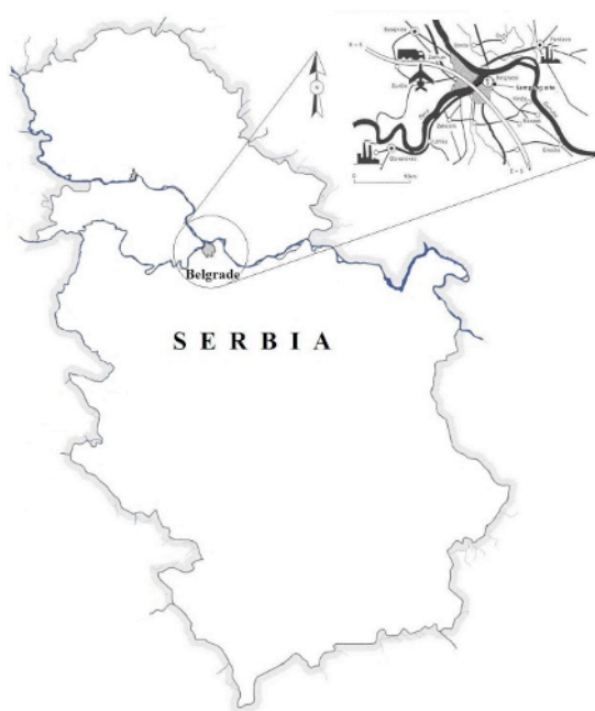
Fig. 1. Sampling site

atmospheric aerosol samples in the following particle size ranges: D_p \leq 0.49 \mu\text{m} , 0.49 \leq D_p \leq 0.95 \mu\text{m} , 0.95 \leq D_p \leq 1.5 \mu\text{m} , 1.5 \leq D_p \leq 3.0 \mu\text{m} , 3.0 \leq D_p \leq 7.2 \mu\text{m} and D_p \geq 7.2 \mu\text{m} .