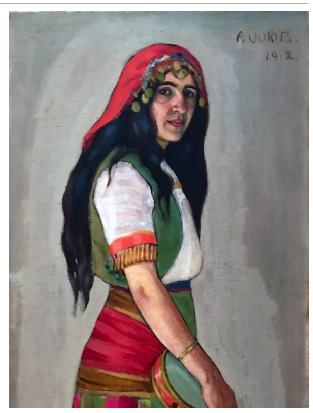
Figure 3 Aleksander Uurits, Roma Woman. Formerly titled Gypsy Woman. 1912. Oil painting.

the overtly emotional responses. The debate around Rendering Race revealed the continued urgency and need to negotiate the Soviet-era narratives of trauma when discussing colonial injustices which are seen to be far removed and secondary in comparison to the more recent Soviet colonial regime.