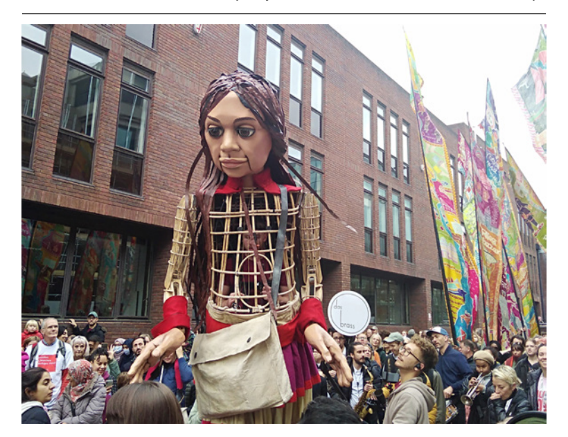
Figure 3 The Walk in London, October 2021.

We've got to be really clear about that. The route we're taking is a route which refugees have taken, but we stay in hotels, we have passports. (Lan quoted in Gentleman 2021)