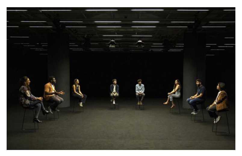
Figure 1 Still from the online discussion "8 Athenians Discuss: What Does it Mean to be an Active Citizen Today?", 2022. Onassis Stegi, Athens.

tion - speaking with and to movements around the world. To borrow an idea from the philosopher Kostas Axelos, relational citizen media conveys a kind of planetary thought (1964), and these cross-movement gatherings manifest as "roundtables of eternal return" (Deleuze 2004, 157) - rhythms and relays and relations that loop across trajectories in space-time on a global scale.