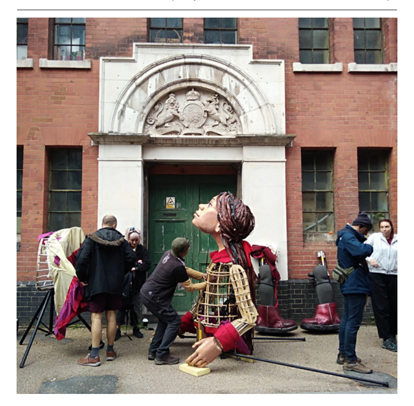
Figure 2 The puppeteer (left) is preparing to put on the puppet, while a member of the staff is checking 'the harp'. London, October 2021.

The aesthetical device of the empty machine is also a response to the ethical criticalities concerning the representation of refugees. Through this non-fictional tool which has to be filled by the viewer's imagination, The Walk refuses any narrative or descriptive frame that is often adopted by theatrical and performative productions with/ about migrants. As a growing scientific literature is pointing out (Jeffers 2012), most of these artistic works are focused on tragic tropes and refugee stories<sup>25</sup> usually written and directed by non-migrants. This testimonial imperative raises a series of ethical questions about representation and authorship that risk falling into a racialising approach. On stage, the refugee is often forced into the role of telling a biography of pain in front of the audience, waiting for the possibility of existing. He/she is worth as much as his/her story of traumas