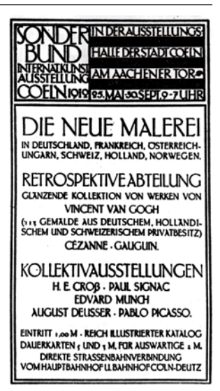
Figure 1 Announcement of the International Art Exhibition of the West German Sonderhund, 1912 (Selz 1957, 242)

the Sonderbund exhibition in 1910. General conservative opinion assumed that there was a conspiracy of Parisian and Berlin art dealers in favour of French art, who had been stringing Germans along and imposing on them overpriced art by foreigners instead of supporting the local schools. Other alleged plotters were progressive museum professionals and critics, who together with the artists blindly following the French were betraying the national traditions (Selz 1957, 238).