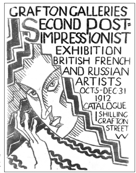
Figure 3 Cover for the catalogue of the Second Post-Impressionist Exhibition. 1912.

to art criticism a solid analytic base, was inextricably combined with his idealism concerning the act of aesthetic contemplation (Twitchell 1987, 42). The same rigour was applied in the way he structured the timeline he drew throughout his two exhibitions. In preparation for the Second Post-Impressionist Exhibition. Fry was much more eager to insist on the linearity of contemporary art development than he was in the previous show. He sought to place one master after another and to structure his narrative as a vital evolution of expressive means.