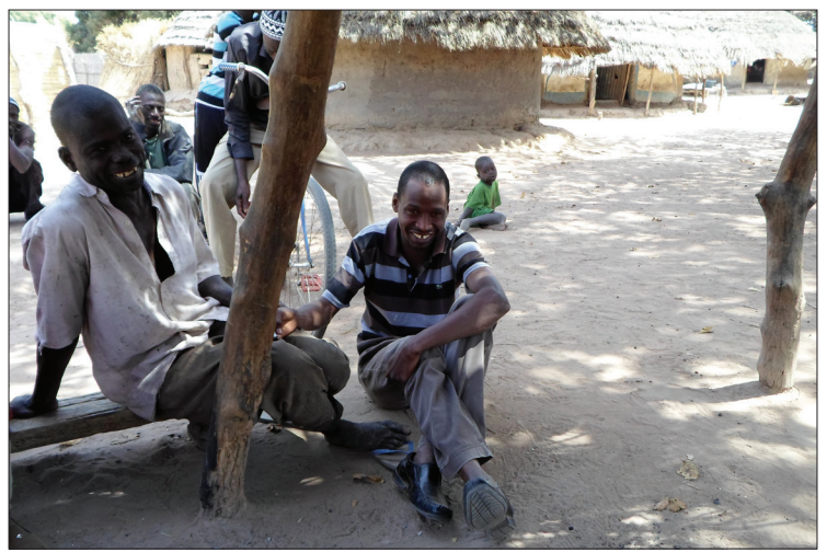
Sare Dembayel, upper Casamance region, southern Senegal in 2014. Photo by author. All rights reserved.

Shadows of slavery: refractions of the past, challenges of the present