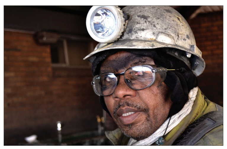
A mine worker in South Africa.

Shadows of slavery: refractions of the past, challenges of the present