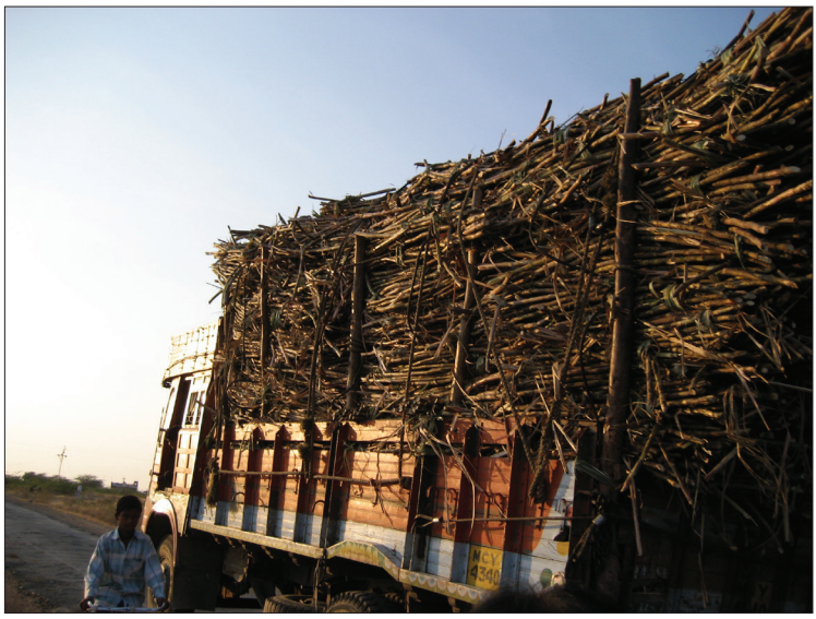
Truck transporting sugar cane.

Shadows of slavery: refractions of the past, challenges of the present