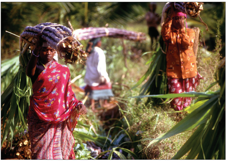
Harvesting sugar cane in India.

slavery programme. One of our most arresting findings was that the people most likely to work in slavery-like conditions tended not to be the poorest of the poor.