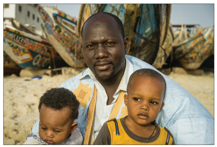
A family at the Fisherman's Beach in Nouakchott, Mauritania.

exploitation of Haratines by Beydanes rest on ethnic elements: the 'white' leading class exploits the poorest, which is that of the Haratines. However Haratines, Dah Abeid says, are "black autochthones" (black indigenous) and thus their claims of equality and full citizenship is legitimate. Due to enslavement, they have been forcefully assimilated into the Arab society, thus causing their identity to be "African, Arab, and Berber, forged with pain by oppression".