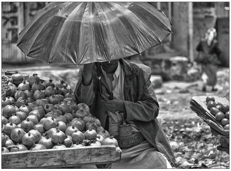
Pomegranate seller, Yemen.

of them dwelled in rural areas of western and southern Yemen. However, after the 1962 revolution establishing the Yemen Arab Republic, many akhdam were compelled to work as salaried street-sweepers in major cities.