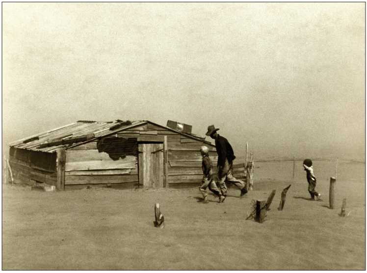
Cimarron County, Oklahoma, USA, 1936. Public Domain.

known as effective 'agriculture value chains': i.e. the integrated range of value adding activities that theoretically should link farmers to new global or regional markets, improve and 'rationalise' agricultural production, and keep prices low for a growing global population.