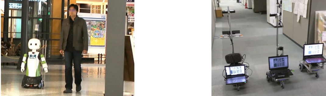
Fig 1: Left: implementation of side by side walk. Right: group motion implemented in a 3 robot system.

features); relative distance, relative angle and relative velocity (social features); distance and angle towards (sub-)goals (environmental features). To implement the cost function a prediction grid containing possible future locations of each agent was used, and the cost of each cell for each agent was computed by summing each different feature with proper weights. Finally, the location that minimizes the cost of the double anticipation is selected. The implementation of the system is shown in Fig. 1 (left).