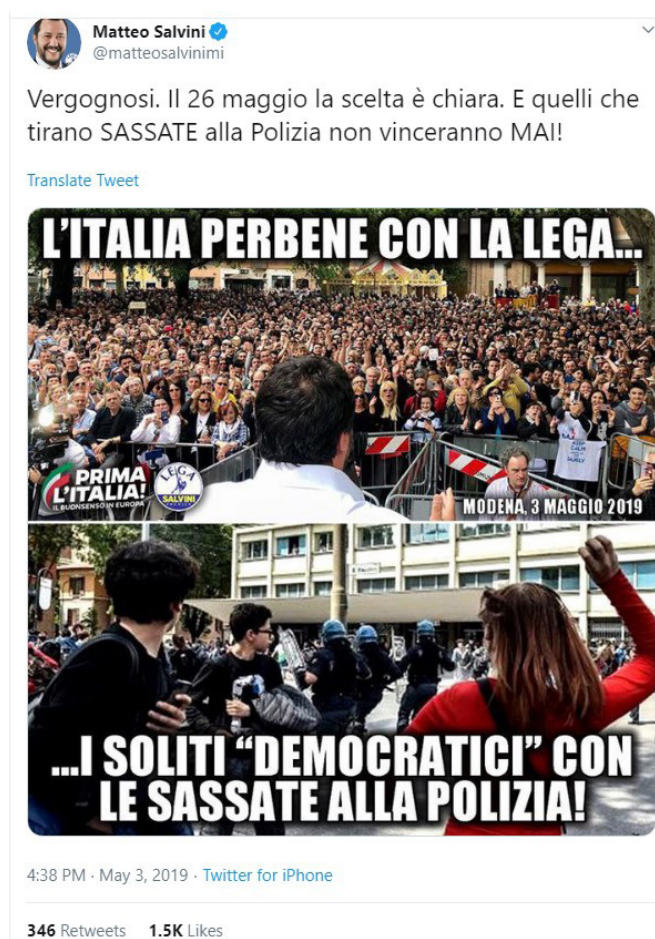
Figure 7.2. Matteo Salvini [@matteosalvini]. (2019, May 3). An example of polarization by image juxtaposition.

The image that accompanies one of Salvini's tweets of 3 May is exemplary of this strategy (see Figure 7.2). The top half – the location of what is ideal, according to Kress and van Leeuwen (1996) – shows Salvini looking at his public at an orderly gathering of the Lega, whereas the bottom half – the location of what is real – shows a woman throwing stones at the police. The headings implicitly compare “decent Italy with the Lega” (“l’Italia per bene con la Lega”) and “the same old ‘democrats’ throwing stones at the police” (“i soliti ‘democratici’ con le sassate alla polizia!”), in which the term “democrat” implicitly recalls the Democratic Party and its support for the activists of Italian social centres. It is worth noting that, even when Salvini portrays his adversaries as aggressive, in the tweets under consideration he never