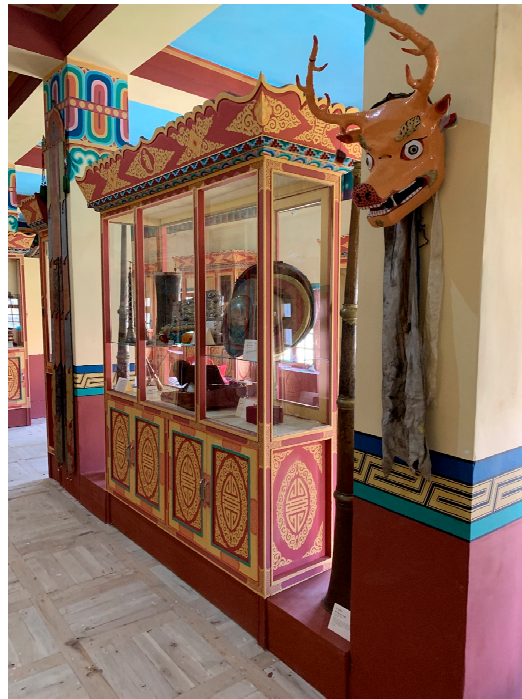
Figure 7. The new Chemde Monastery Museum, Ladakh.

This does not mean that such objects cannot retain their intended purpose, however, when placed in a museum, as can be observed from the creation of Tibetan monastery museums in the Himalayan region—specifically museums inside monastic complexes (Figure 7)—as well as Tibetan museums, such as those in Dharamsala. 23