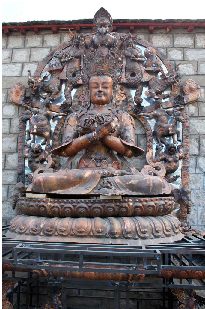
Figure 5. Unfinished Vajradhara metal statue in a Buddhist art workshop near Sera Monastery, Lhasa, Tibet.

As already described, it is necessary, after the creation of an image, to invoke the divinity or the ‘descending entity’ to ‘reside’ within it, thus guaranteeing its canonicity ( Bentor 1996 , p. xxi). In this respect, only lamas are entitled to decide if an image is suitable or not. A fundamental characteristic of Tibetan Buddhist art is its relevancy to specific artistic canons, realised through two main elements: iconography, namely the representation of the divinities on the basis of the ritual texts that describe them ( Figure 6 ); 11 and iconometry, the codified system of proportions 12 for each religious class of subjects, for example, Buddhas, Bodhisattvas, and Dharmapalas. 13 The proportions