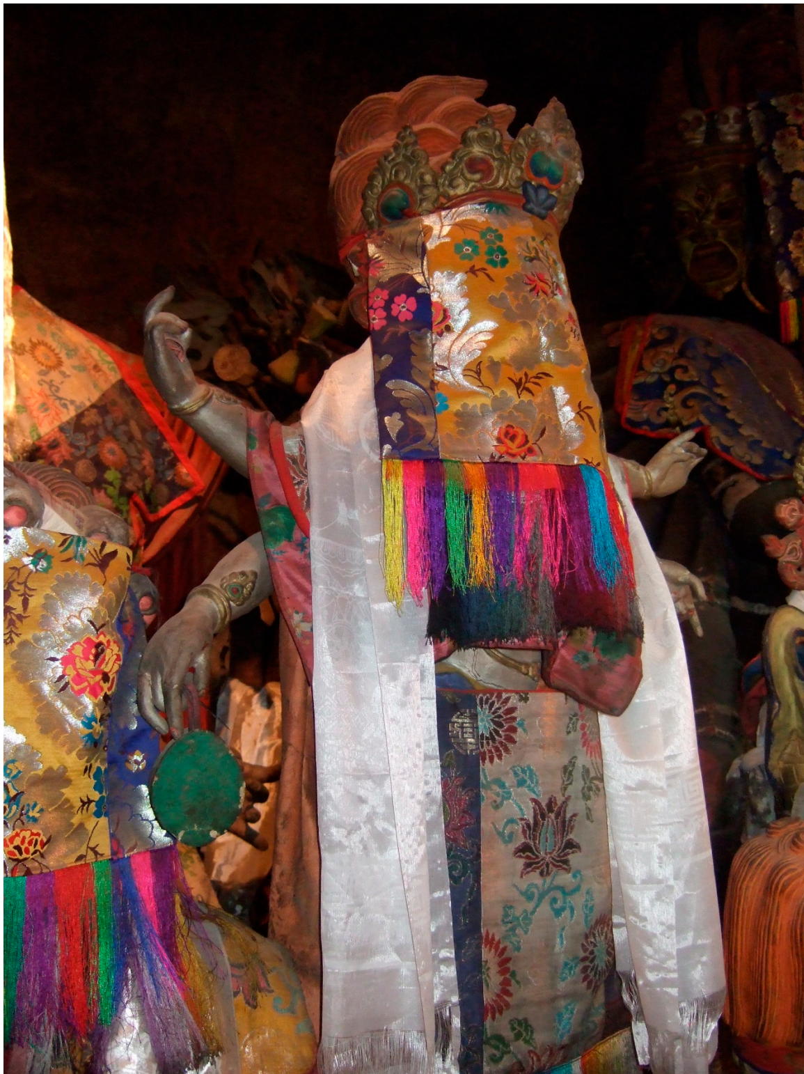
Figure 14. Statue of a Dharma Protector covered by a brocade curtain, Thikse Monastery, Ladakh.

Since the postcolonial turn from the mid-1980s on, museums in the West have been debating the most appropriate ways to display their collections—in relation to which objects should be exhibited, how they should be interpreted, and, most significantly of all, who has ultimate control over what is selected for display. Postcolonial critiques, as well as the demands of indigenous peoples, have