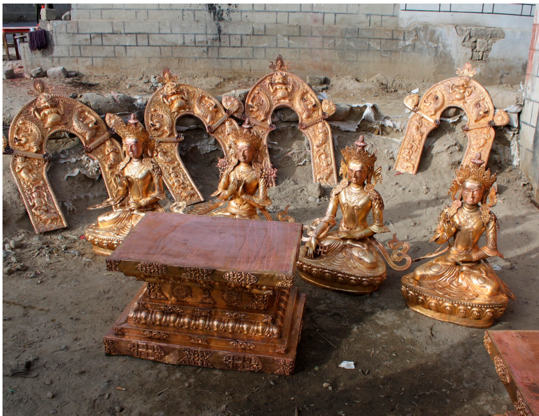
Figure 4. Unfinished metal statues in a Buddhist art workshop near Sera Monastery, Lhasa, Tibet.