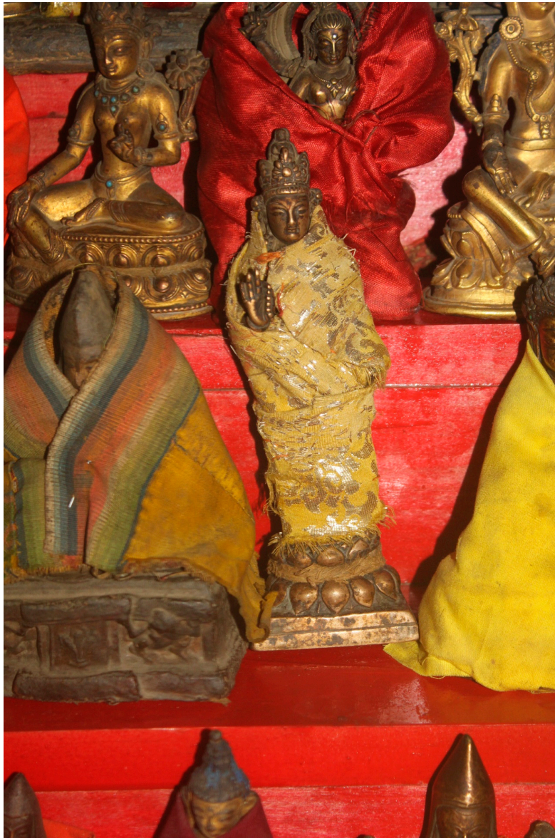
Figure 8. Shrine with statues in Karsha Gompa, Zanskar, Ladakh.

many statues, paintings and ancient objects have been stolen over recent decades (see for example Chao 2018 ).