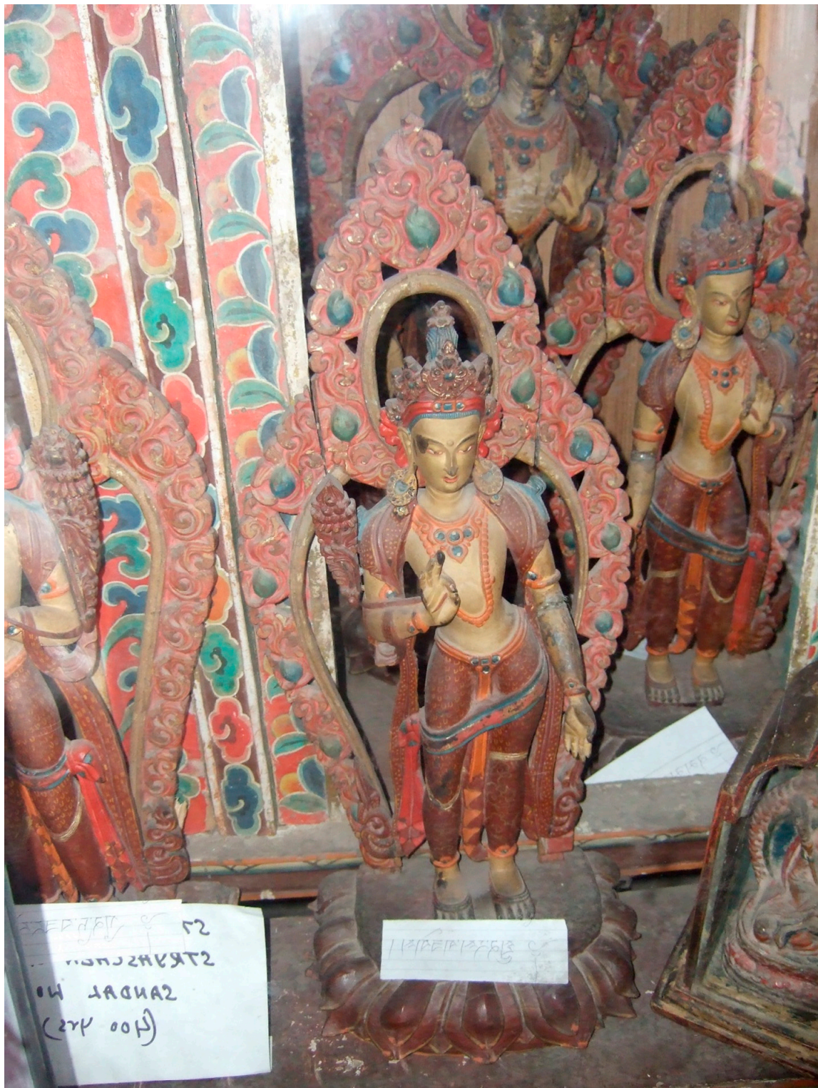
Figure 11. Shrine with wooden statues, Stakna Monastery, Ladakh.

English, with the names of the deities in Tibetan. The altars here have glass in front and thus, in a sense, blur the boundary between a sacred, active space for local Buddhists and an educational display for foreign tourists.