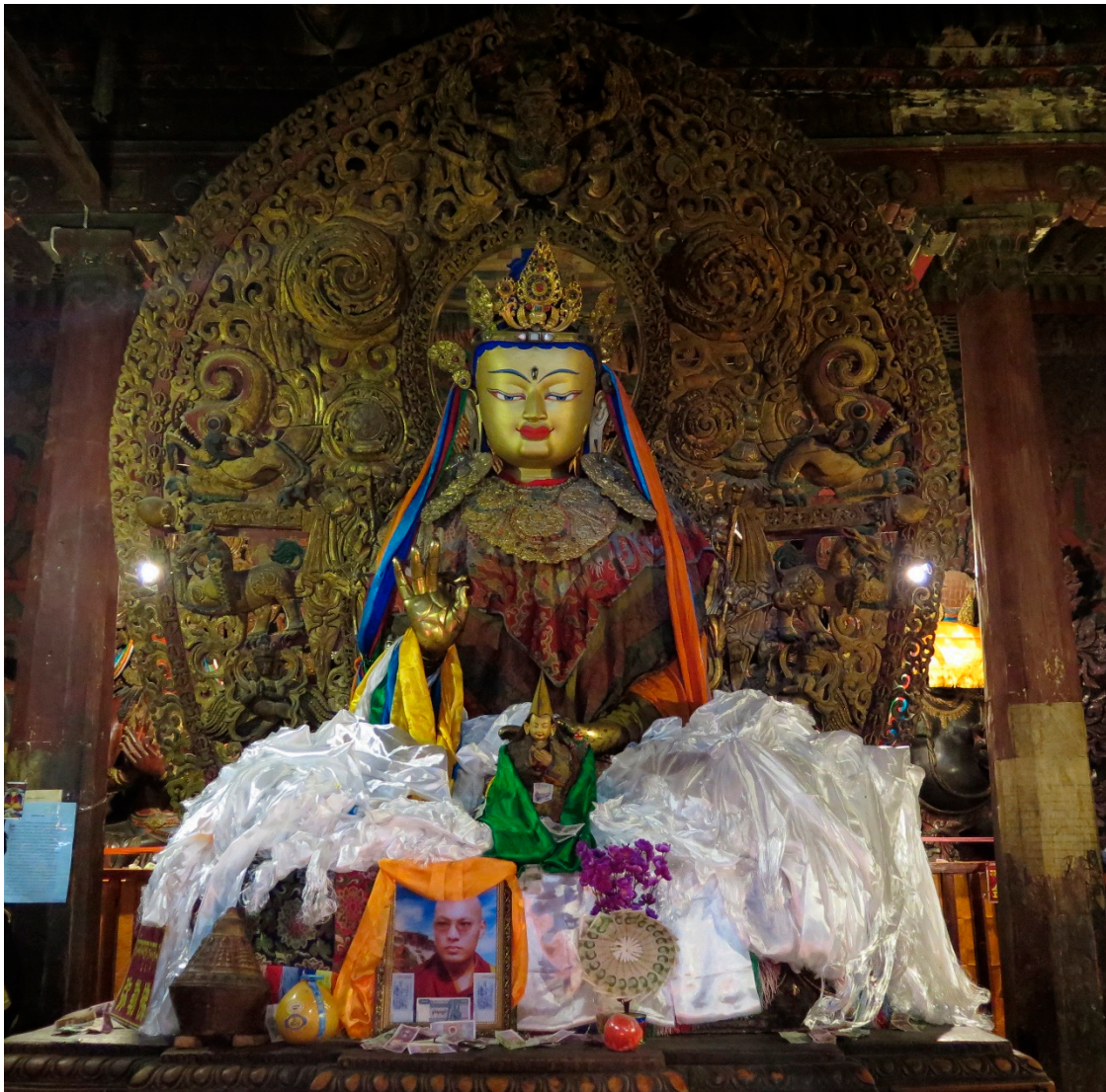
Figure 1. Silk scarfs and offerings to the statue of Maitreya, Gyantse Tsuklakhang, Tibet.

In order to fully appreciate Himalayan Buddhist art then, it is necessary to understand religious meanings and specific symbolism rather than aesthetic criteria. In addition to the spiritual meaning that the sacred image conveys, its own creation, from a Buddhist perspective, is aimed at improving one's karma and developing merit for the future. Although improving karma is possible by removing obstacles and through creating well-being, it can also be achieved, specifically, as a result of commissioning sacred objects.