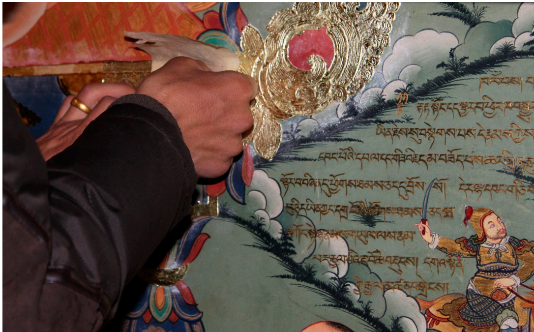
Figure 3. A painter gilding his wall painting, Ramoche Temple, Lhasa, Tibet.

artistic production has for Tibetans. The artists, in fact, are not simply creating aesthetically valuable works; they are also giving a worldly body to the Buddhist deities.