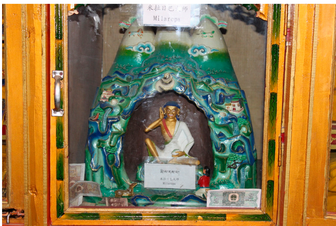
Figure 12. The saint and poet Milarepa, 20th century, clay, Drepung Monastery, Tibet.