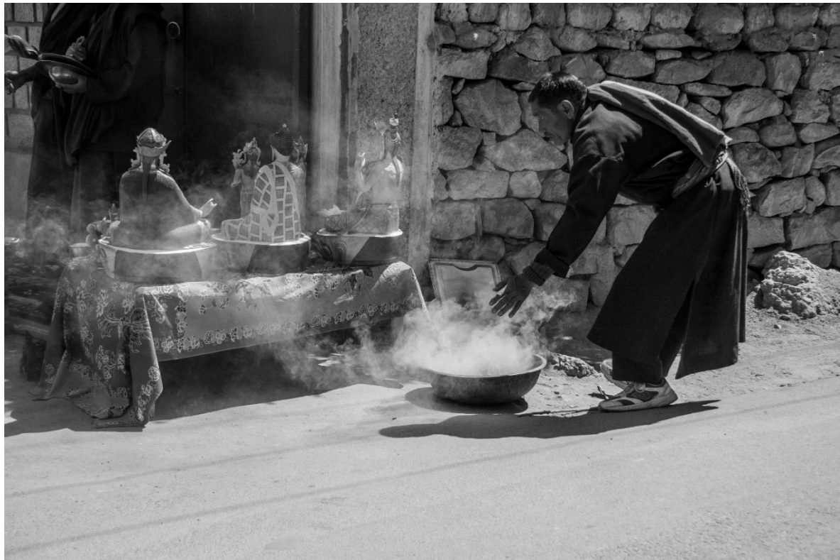
Figure 2. Consecration ceremony for statues, Sankar Gompa, Leh, Ladakh.

Sacred images cannot be used for religious purposes without this authentication, until their internal spaces—in case of statues for example—are filled with relics, precious substances, jewels, medicinal herbs and, most importantly, written prayers (mantras or invocations) and then sealed. 8 Ready-made images and ritual items which have been sold since the second half of the 20th century in the tourist markets of the Nepal Valley, for example, cannot therefore be regarded as ‘sacred’ or ‘liturgical’ in any traditional sense. 9 To be considered ‘sacred’ by local Buddhist practitioners, images must be properly represented and consecrated.