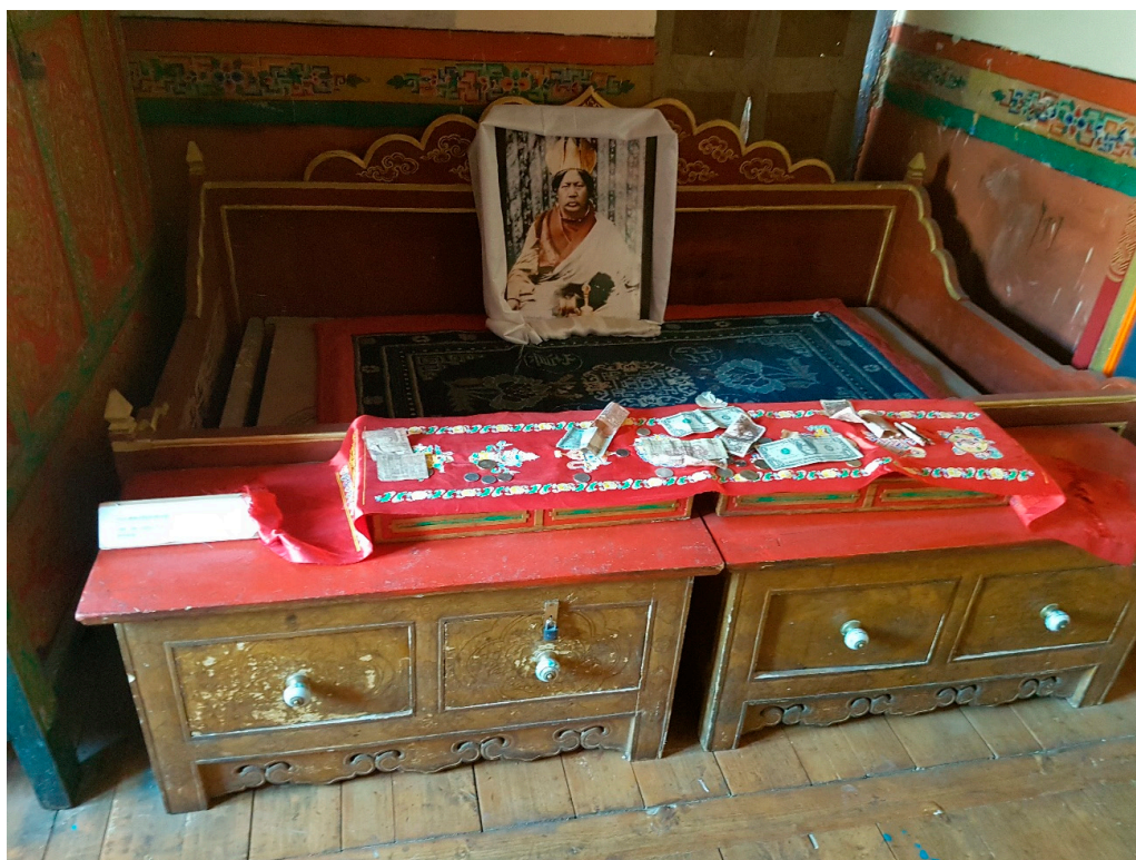
Figure 10. Photo of Taktsang Repa, Chemde Monastery Museum, Ladakh (photo Tythacott 2017).

( stag tshang ras pa , 1574–1651). It is notable that local visitors move around the exhibition rooms in this building, regardless of the layout of the cases, in a clock-wise direction, undertaking a ritual, known as a 'kora' ( skor ra )—a circumambulation performed by walking clockwise (usually around a stupa or mountain) as part of a ritual Buddhist practice. Many visitors at Chemde were observed by the authors stopping off for prayer as they processed around the displays, bowing their heads, hands held together at chest level, murmuring in front of particularly potent images. Offerings of money were left in front of certain deity statues in the museum, on Taktsang Repa's couch, and a white silk scarf ( kha btags ) was placed as a sign of respect and reverence over the framed photograph of a reincarnation of Taktsang Repa (Figure 10).