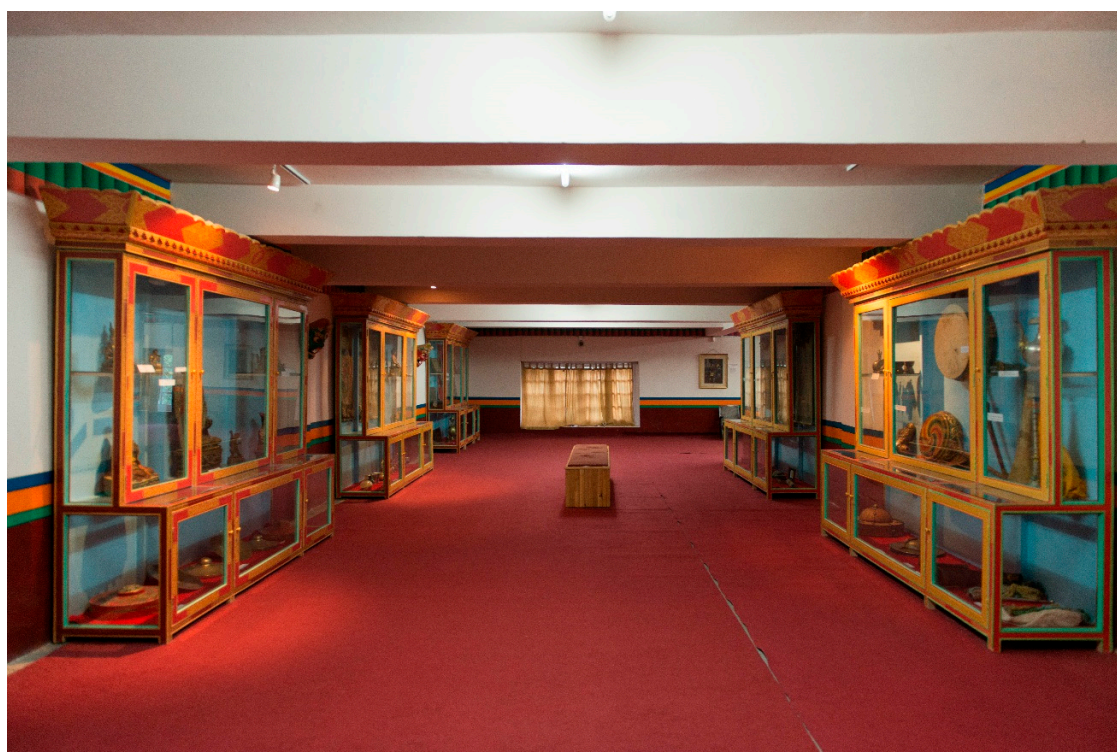
Figure 9. The Hemis Monastery Museum, Ladakh.

These monastery museums have been established for a range of reasons. Tibetan monks cite protection, security, education, as well as making money by attracting tourists, as the main motivators. 28 Some monasteries have large and important collections, and can only fit a limited number of items onto the altars in the shrine rooms, so a high percentage of material has, historically, been stored away. As objects have been stolen in the past, there is today a growing consensus that collections would be more secure if cased and on public display. At Hemis monastery, the Twelfth Gyalwang Drukpa (b.1963)—leader of the Drukpa Kagyu sect of Tibetan Buddhism—took the decision to build a museum thereby making objects accessible and secure. A number of Tibetan monks interviewed by the authors emphasised the significance of demonstrating Buddhist heritage to outsiders, with museums becoming increasingly important for the tourist industry. 29 Museums, thus, are intimately associated with new values emerging as a result of Westernisation. A number of monks also indicated that, for them, museums are a way to demonstrate and celebrate their individual monastery’s history and identity. How, then, do the monasteries deal with the display of some of their most sacred objects in these new Western-style spaces?