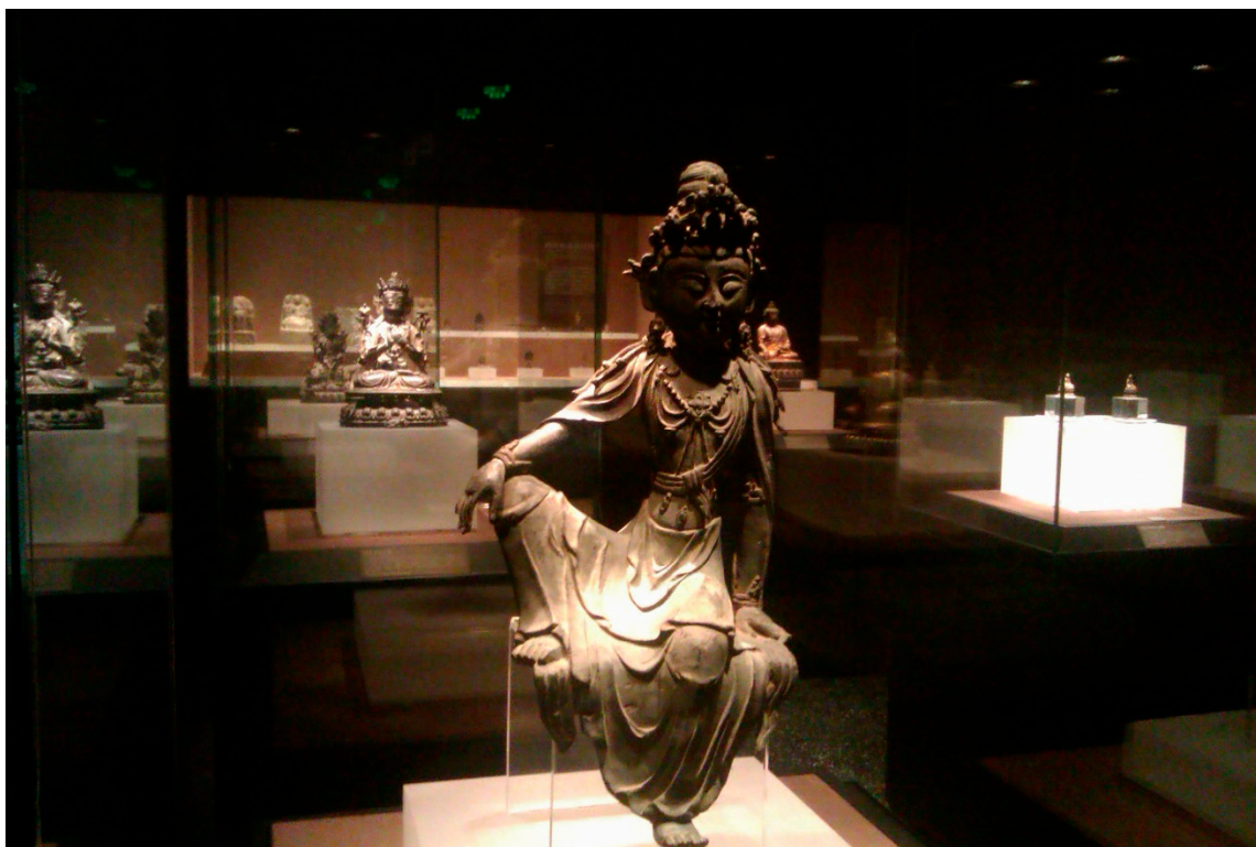
Figure 13. Bodhisattva on display in the "Selected Works of Ancient Buddhist Statues" Gallery, Capital Museum, Beijing.

upon Tibetan material. Alongside the design emphasis on aesthetics in many of China's key museums, with sculptures individualised on plinths and dramatic spot lighting (Figure 13), Tibetan artefacts have been overtly harnessed and interpreted for political ends, used, as Varutti asserts, as 'a platform for nation building' (Varutti 2014, p. 161); 'to create and disseminate specific narratives of the Chinese nation' (Varutti 2014, p. 59); and to 'provide political legitimation' (Varutti 2014, p. 90). 37