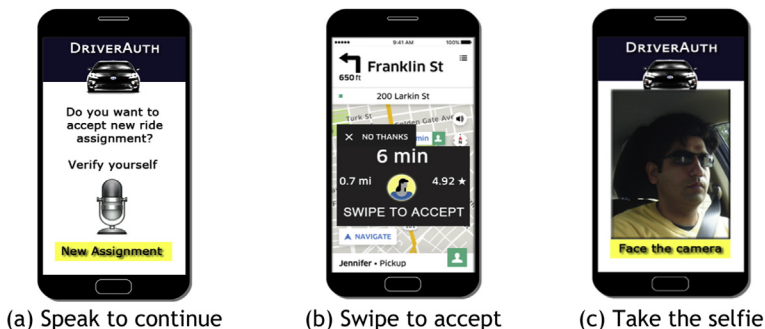
Fig. 1. DriverAuth: A new ride-assignment process.

Our prototype applications use client-server architecture. The data generated, as a result of user's actions, i.e., swipe and voice command, was encrypted and packetized on the client device, i.e., smartphone, and was instantaneously transferred to the server, for further processing, i.e., verification of the user's identity [1].