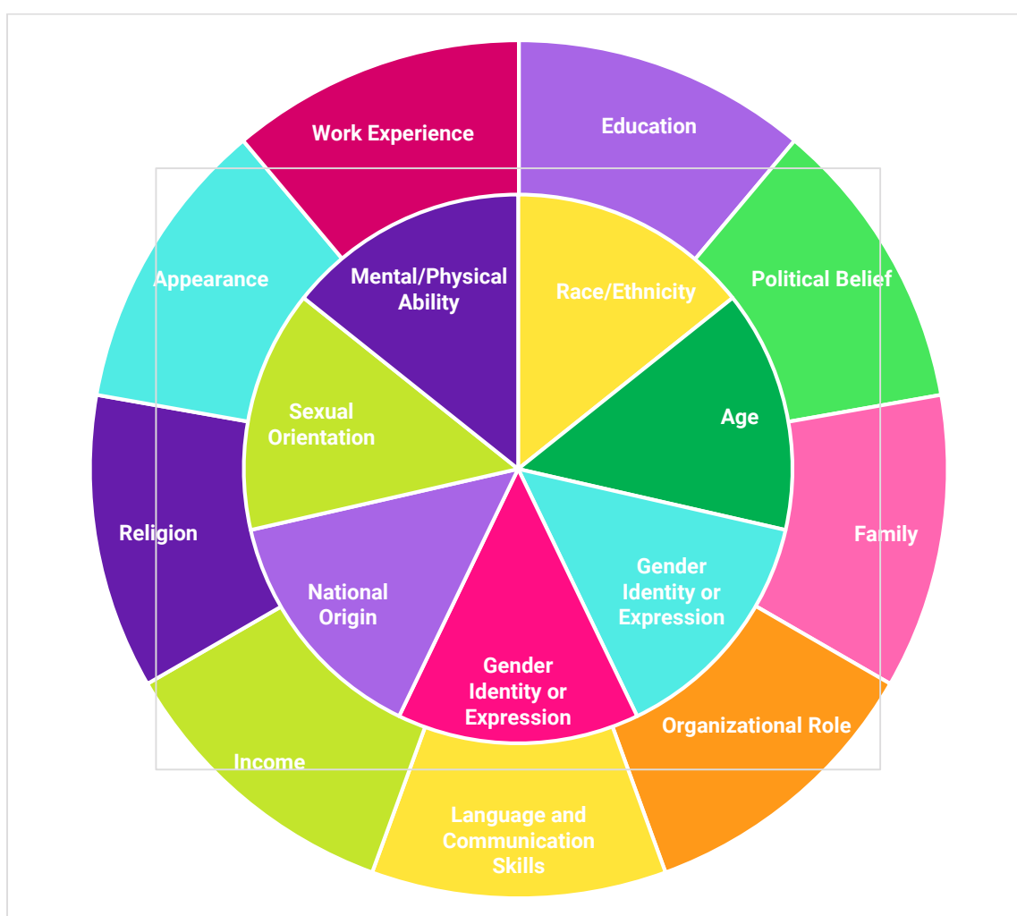
Figure 5: Diversity Wheel 4

Ask the students to individually identify their comfort zone of difference and the reasons for their choices and share with their peers in small groups. Then ask students to identify