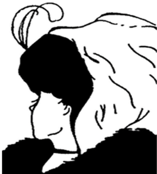
Figure 4: What do you see image

If a student says they see a young woman, ask them to point it out. Do the same with a student who sees an old woman. Ask the students to then share how they feel about the students who saw the same thing as they did, and about the students who saw something different. Then ask them if there was ever a time when they saw something one way and another person saw it differently. Ask the students who replied yes how they felt about the