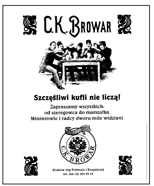
FIGURE 2 Advertisement for the C&K Brewery: 'our doors are open to everyone, from common soldier to sergeant. Ministers and imperial advisers are particularly welcome' (Czuma and Mazan, Austriackie gadanie czyli Encyklopedia Galicyjska , reprinted by kind permission of Anabasis, Krakow).

Beyond its role as simple marketing tool (discounted by many as merely a means of signalling the given product's long heritage and thus its worth vis-à-vis shoddy state