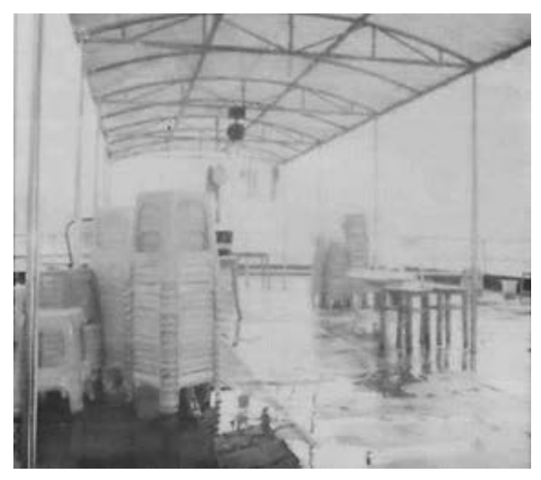
Figure 4. a) Cruise ship docked at Jiuwan Stream; b) Upper deck with plastic furniture