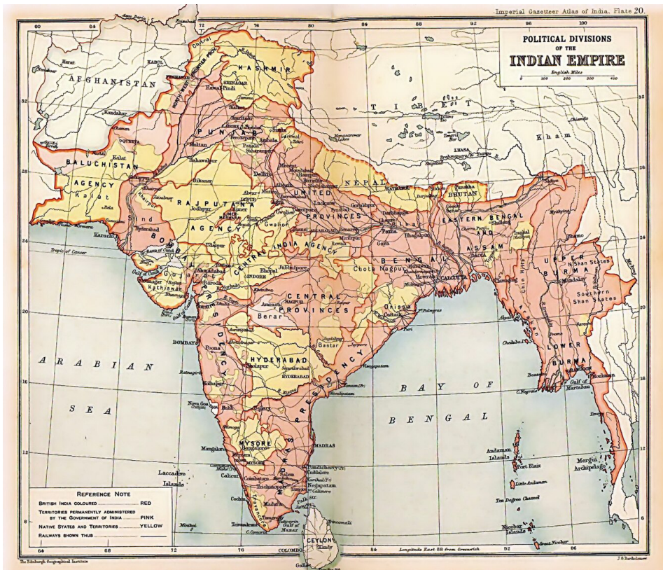
Fig. 2 – Map of British India and Native States