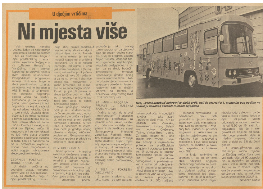
Figure 1: The “merry bus”, as the caption beneath the photograph has it.

Every day, the three buses of the “Ratimir Herceg” kindergarten with their teachers go to the local communities within the municipality. These are mobile kindergartens, that is special-purpose buses, which have been going to sites outside Varaždin for 10 years in order to gather pre-school children. (10-godišnjica pokretnog vrtića Ratimir Herceg, Varaždinske vijesti , 30 April 1987)