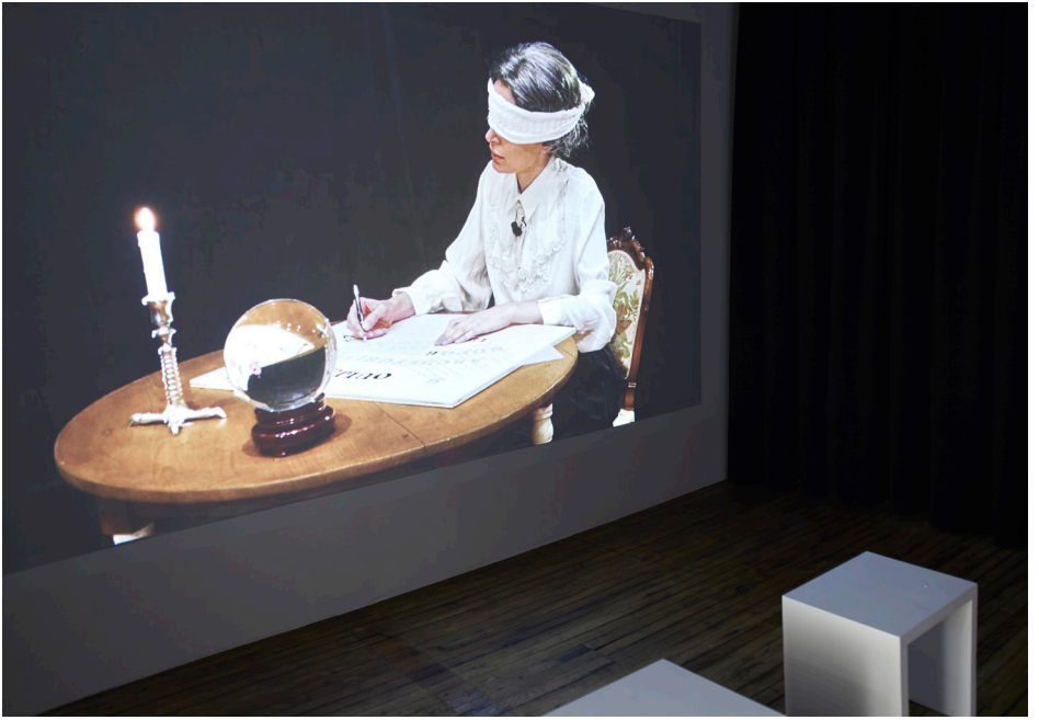
Chiara Fumai, The Book of Evil Spirits , 2015, single channel color video, 26 min. 25 sec.