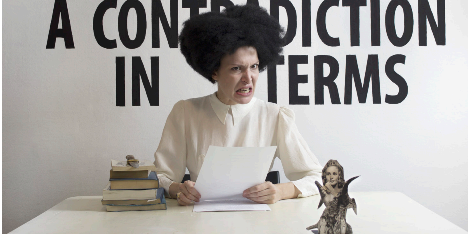
Chiara Fumai, Harry Houdini reads Valerie Solanas , 2013, C-print, 31 ½ × 47 ¼ in. (80 × 120 cm).

A MALE ARTIST IS A CONTRADICTION IN TERMS