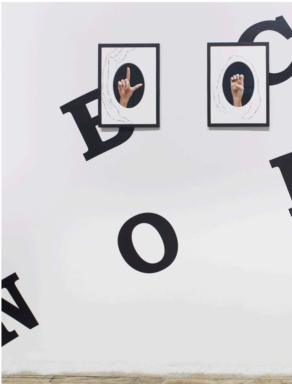
Installation view of Chiara Fumai: LESS LIGHT , 2019.