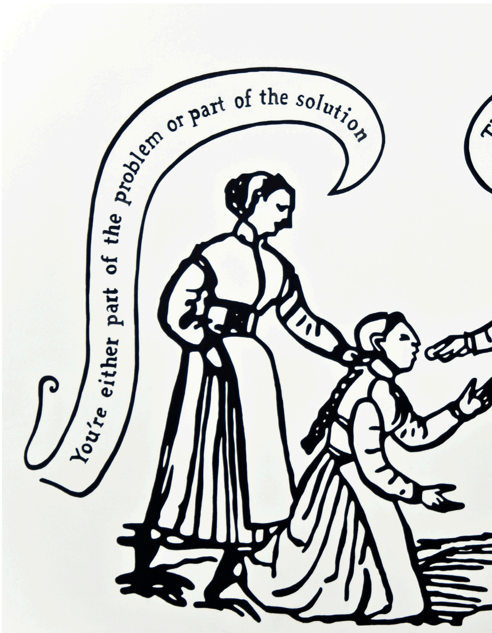
Chiara Fumai, I Did Not Say or Mean 'Warning' (detail), 2013, wall drawing, performance document, text by Anonymous Woman, 78 × 131 in. (200 × 332 cm)