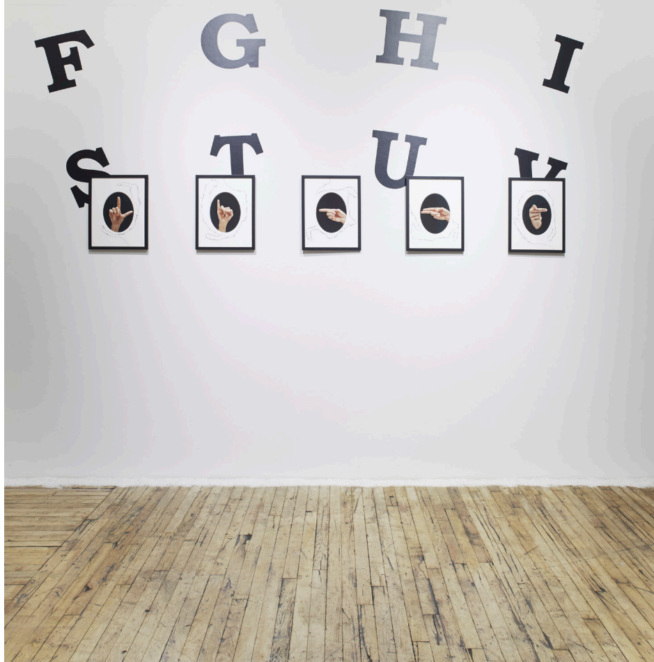
Installation view of Chiara Fumai: LESS LIGHT , 2019.