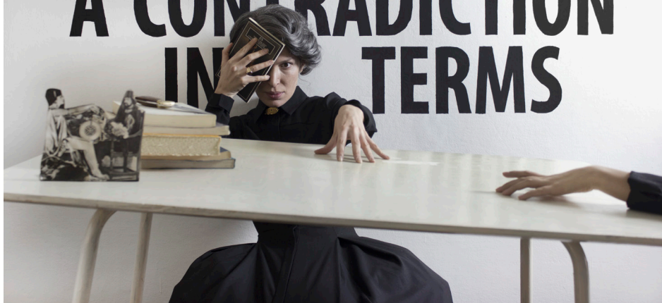
Chiara Fumai, Annie Jones reads Valerie Solanas , 2013, C-print, 31 ½ × 47 ¼ in. (80 × 120 cm).

A MALE ARTIST IS A CONTRADICTION IN TERMS