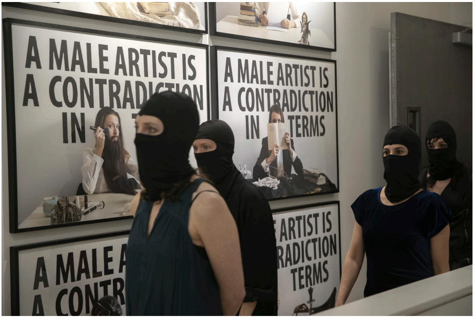
The S.C.U.M. Elite , 2019, as performed in the exhibition Chiara Fumai: LESS LIGHT .