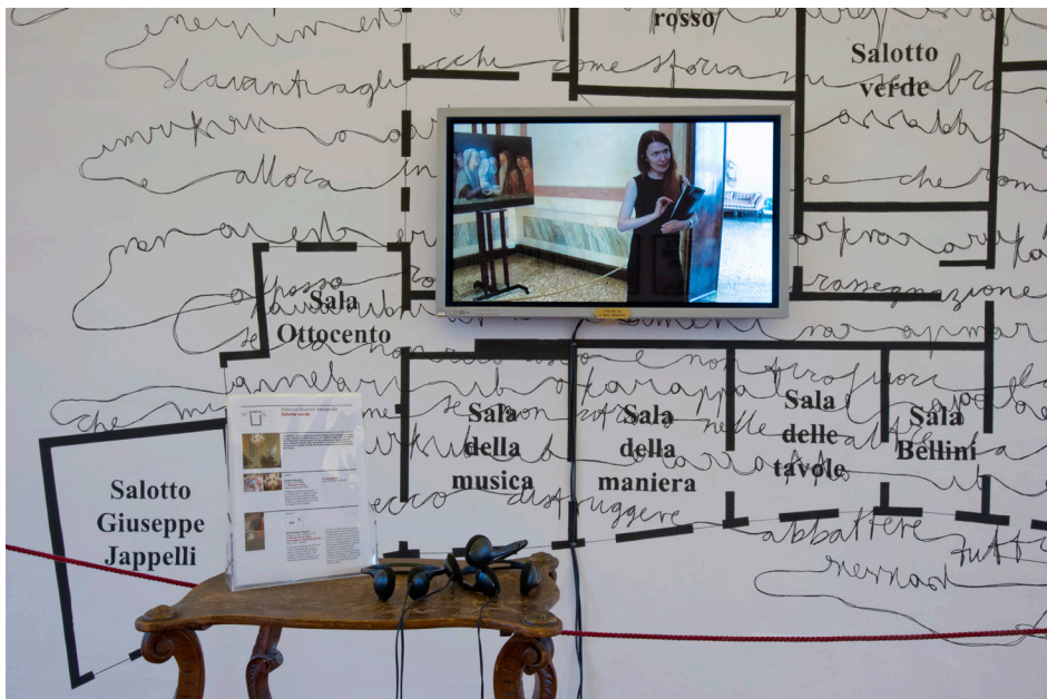
Chiara Fumai, Der Hexenhammer (detail), Museum Project Room, 2015. Photo: Luca Meneghel