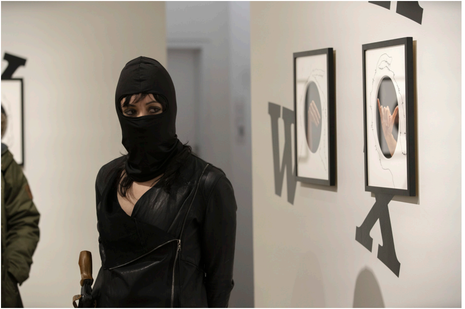
The S.C.U.M. Elite , 2019, as performed in the exhibition Chiara Fumai: LESS LIGHT .