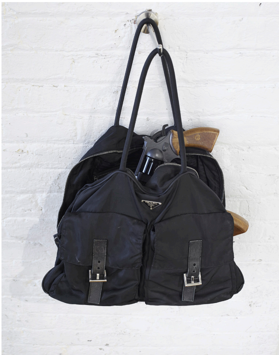
Chiara Fumai, Prada Bag with Guns and Balaclavas , 2016, bag, fabric and plastic, 21 × 16 × 9 in. (50 × 22 × 26 cm).