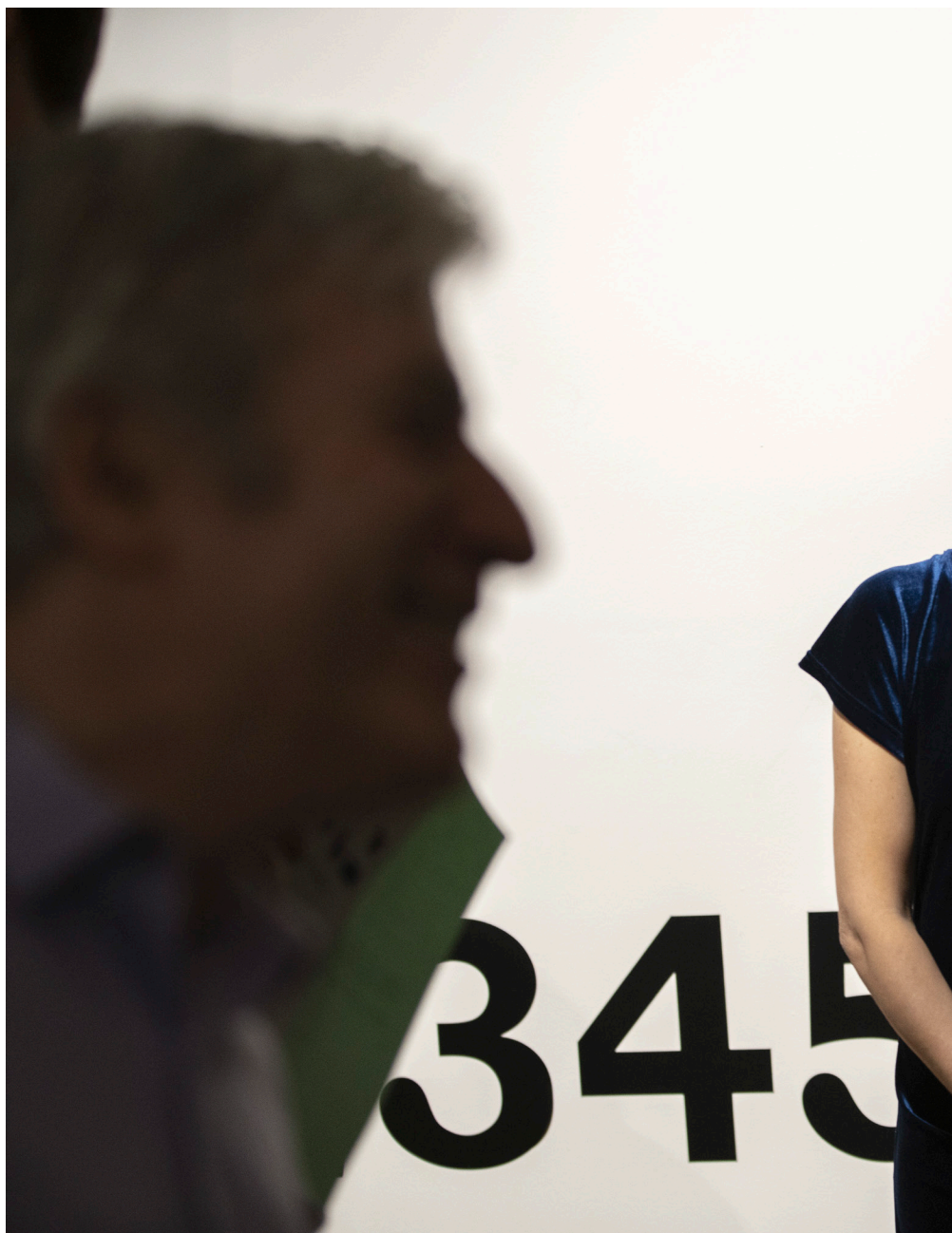
The S.C.U.M. Elite , 2019, as performed in the exhibition Chiara Fumai: LESS LIGHT .