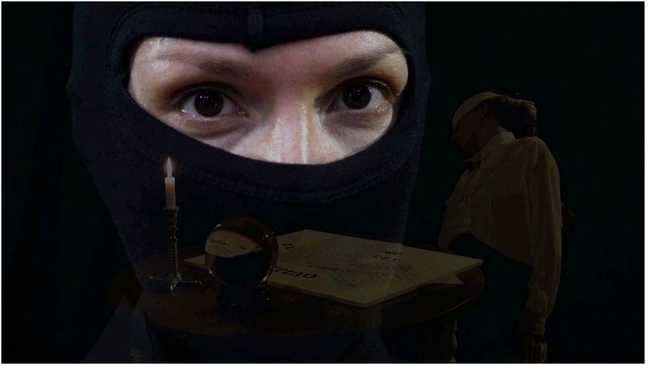
Chiara Fumai, The Book of Evil Spirits , 2015, single channel color video, 26 min. 25 sec.