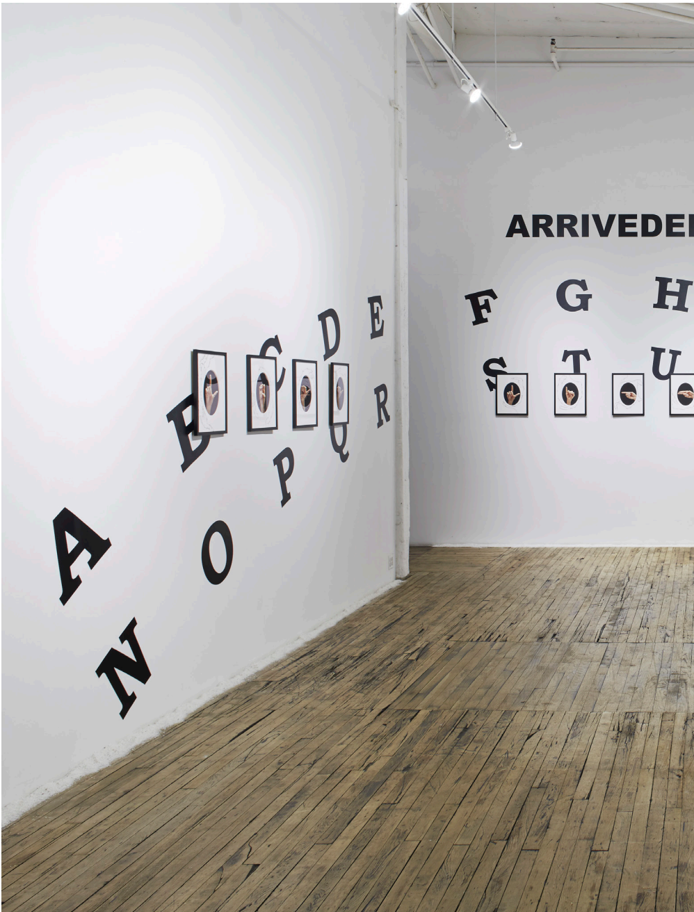
Installation view of Chiara Fumai: LESS LIGHT , 2019.