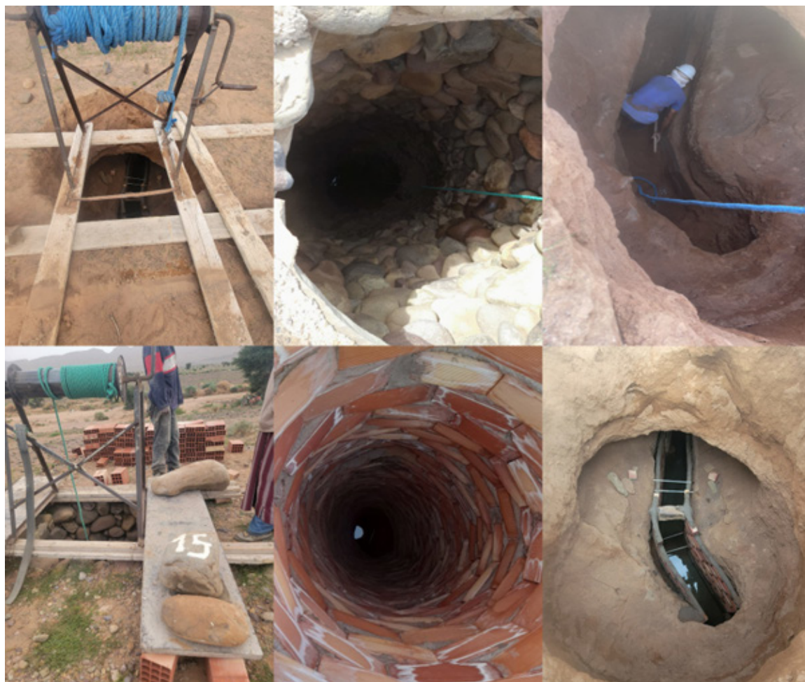
^ Fig. 4 Example of recent maintenance of a khattara near Ait Zeggane (Morocco) with modern techniques and materials. On the left you can see the systems for moving the material along the wells, in the center you can see two wells renovated with stone and bricks respectively, on the right you can see the maintenance work, during and after in a slightly kilned well (Source: Mhammad Houssni, 2024).

sustainable water practices. By seamlessly integrating traditional knowledge with modern needs, qanats stand as enduring symbols of resilience and innovation. Their lessons, deeply rooted in harmony with natural resources, offer a timeless blueprint for the sustainable development of water systems worldwide (Barontini et al. 2018, 2017; Massoud 2022; Messous 2024; Taghavi-Jeloudar et al. 2013; Weingartner 2007).