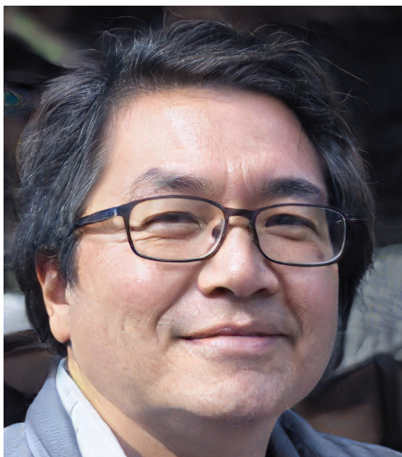
Fig. 6: GANs-generated fake face from thispersondoesnotexist.com (August 3, 2019).

ing occurs, both analog and digital photographs “reflect” reality – even if it can be, of course, a staged reality (van Alphen 2018) – by virtue of the process of imprint-taking through an optical apparatus. On the contrary, in the case of GANs-generated images the artificial intelligence merely “intends” the probability distribution of pixels of the photographs that it has been fed with, in the attempt to decode the statistical law at the core of the original samples and to make of it a specific visual “style” that can be used to produce what can be considered as a subset of pseudographs: automatic, machine-based pseudographs, or, in other words, “digigraphs” (Mercuriali 2019).