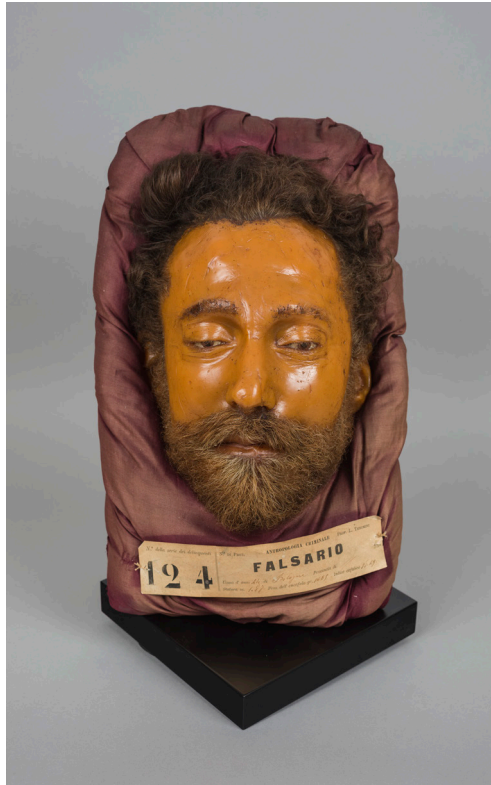
Fig. 1: Wax face of a “counterfeiter”.

As a specific subset of moulages, molded faces were much in vogue in late 19th century criminal anthropology (Pick 1989). In 1892, Cesare Lombroso opened a museum in Turin where he collected, among other specimens, labeled skulls and wax replicas of the faces of “madmen and criminals” (Fig. 1).