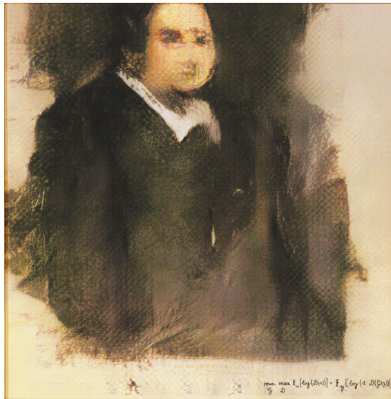
Fig. 5: Edmond de Belamy , from La Famille de Belamy (2018).

On 25 October 2018, a Christie’s auction in New York caused a great sensation. A portrait of a fictional man created (or rather generated) by artificial intelligence and printed on canvas was sold for the staggering amount of $ 432,500, nearly 45 times the initial high estimate (Fig. 5).