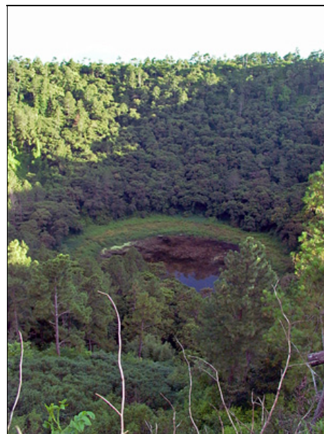
Figure 7. Trou Aux Cerf volcano showing water-filled crater basin. Click to enlarge.

Home | Journal | Archive | Bulletin | Contribute | Subscribe | Contact Us