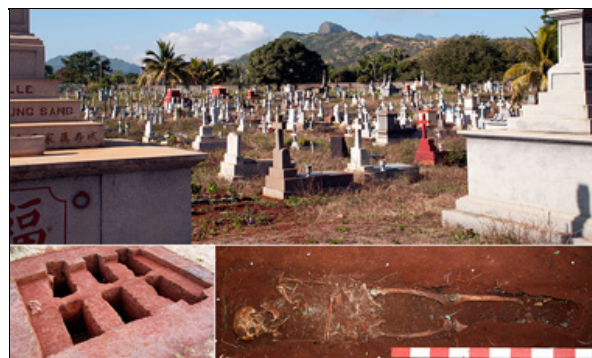
Figure 6. Views of Bois Marchand. Top: the cemetery with Chinese and Christian memorials (Muslim and Hindu sections not shown). Bottom left: six open graves from which eight individuals were recovered. Bottom right: adult skeleton. Click to enlarge.

Through careful integration of historical and archaeological datasets, this project has established a firm basis for understanding the island's rich past. Future work will include a programme of coring of inland (including a dormant volcano, Figure 7) and coastal sites as well as an ambitious plan to scan the island by LiDAR. These interventions will enable us to study how land use and biogeography changed from the post-medieval to the early modern period. They will also allow us to evaluate social transformations, for example through religion, which has served to segregate as well as unite different groups and is a critical marker of identity. On an island where everyone is a coloniser, ecology and archaeology, when combined with history, can provide a fine-grained narrative of the past.