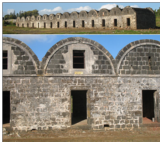
Figure 4. Trianon Barracks. Top: the sequence of barracks. Bottom: detail of a barrack used to house single families. Click to enlarge.