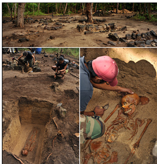
Figure 5. Views from excavations at Le Morne 'Old' Cemetery. Top: the cleared cemetery. Bottom left: child skeleton with coffin outline. Bottom right: double adult inhumation. Click to enlarge.