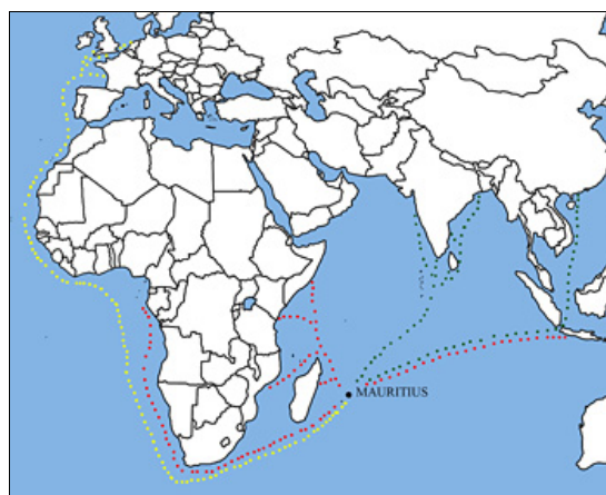
Figure 1. Imperial (yellow), slave (red) and indentured (green) arrivals in Mauritius from the later medieval to the early modern period. Routes are indicative only; the situation was more complex as slaves were also brought from Asia before abolition, and indentured workers were brought from Africa after emancipation.

The volcanic island presents an exceptional opportunity to establish baseline data detailing specific environmental and landscape transitions as they relate to human agency. In addition, despite the fact that Mauritius is noted for having no indigenous population, this should not rule out the possibility that humans interacted with the island prior to the later medieval period. Its strategic position in the Indian Ocean should stimulate interest at least in the potential for early exploration and visitation, if not outright colonisation. Since May 2008, in collaboration with local partners, the Mauritian Archaeology and Cultural Heritage Project presented here has studied aspects of the island's past through the systematic archaeological investigation of a series of sites on Mauritius.