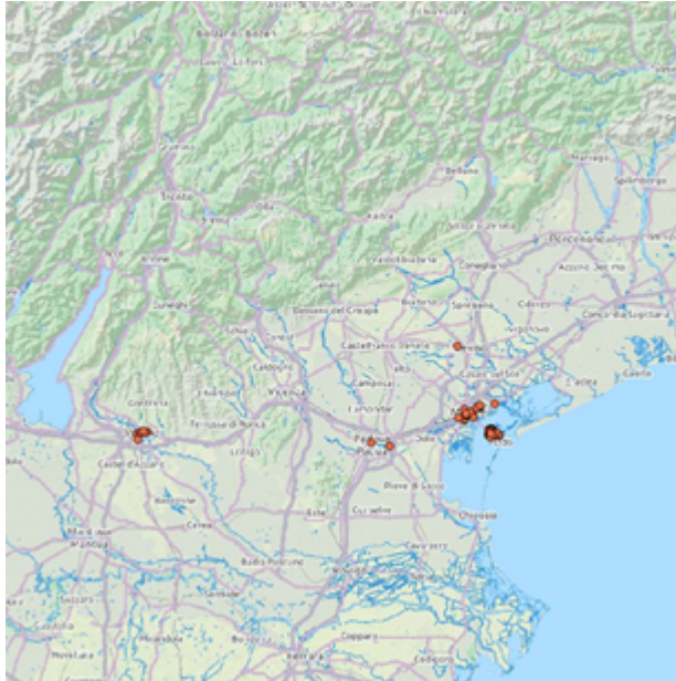
Figure 1, Attractive excellences